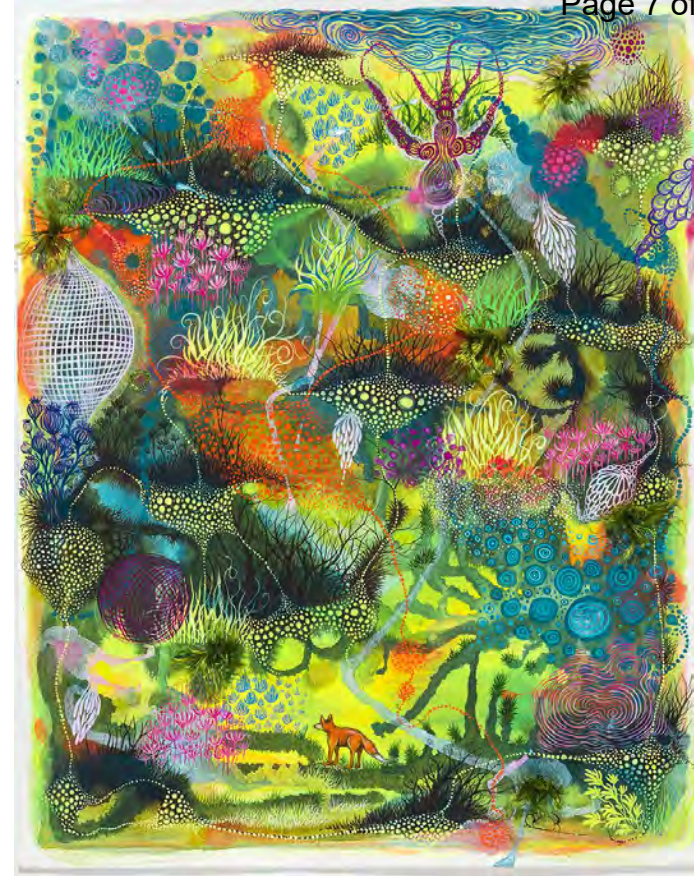
The Sunnyside of My Abstracted Garden, two panels, tapestry