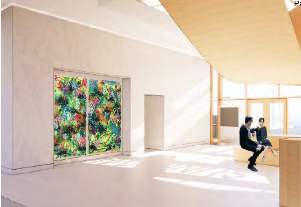
The Sunnyside of My Abstracted Garden , two panel installation, tapestry