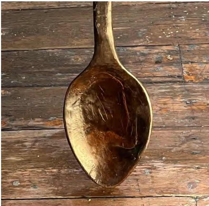
5. Wax spoon detail studio shot to show curvature of spoon.