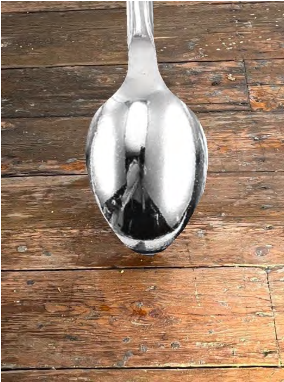
10. Detail of photoshop spoon.