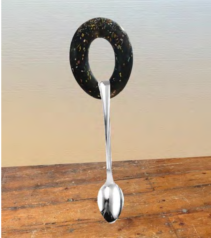
8. Studio photoshop rendering of spoon in polished aluminum, floating background with no rope.