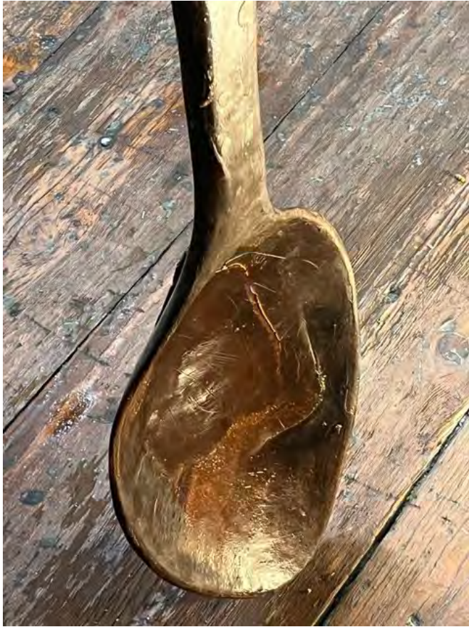
6. Studio shot of wax spoon different angle