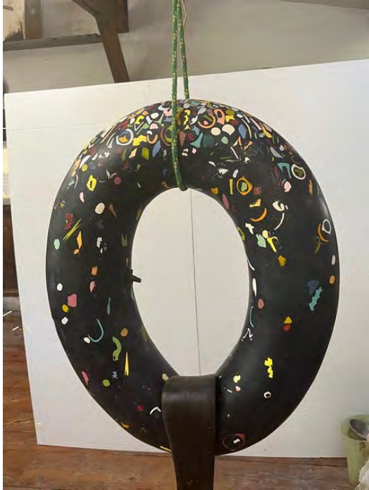
4. Studio shot detail showing colorful inner tube and handle of spoon. The inner tube is full size 24" beach sized inner tube.