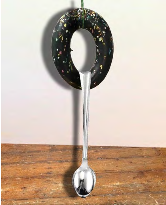
11. Studio photoshop with shadows and hanging rope. Note: Shadows were applied to give a sense of depth. They are going to be much different in the niches with overhead lighting.