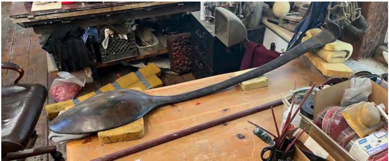
7. Studio shot of spoon removed from the inner tube. Ready for casting preparation.