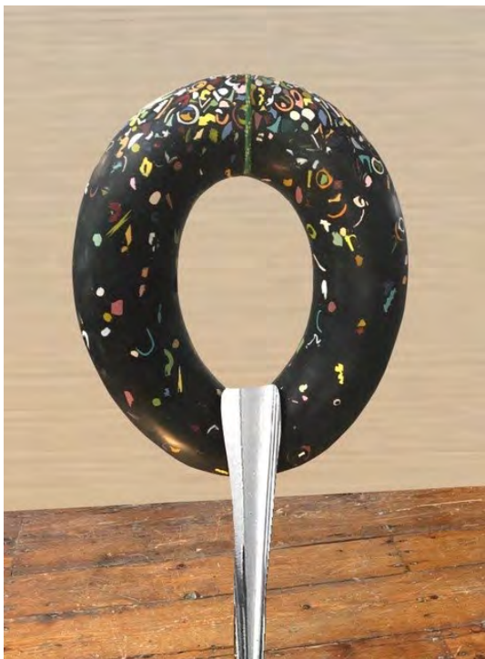
9. Detail of photoshop inner tube and silver spoon.