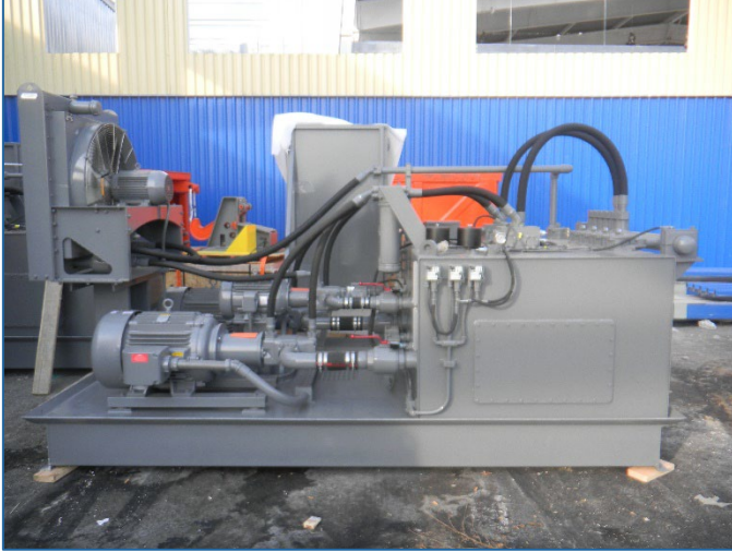
Hydraulic power unit (HPU)