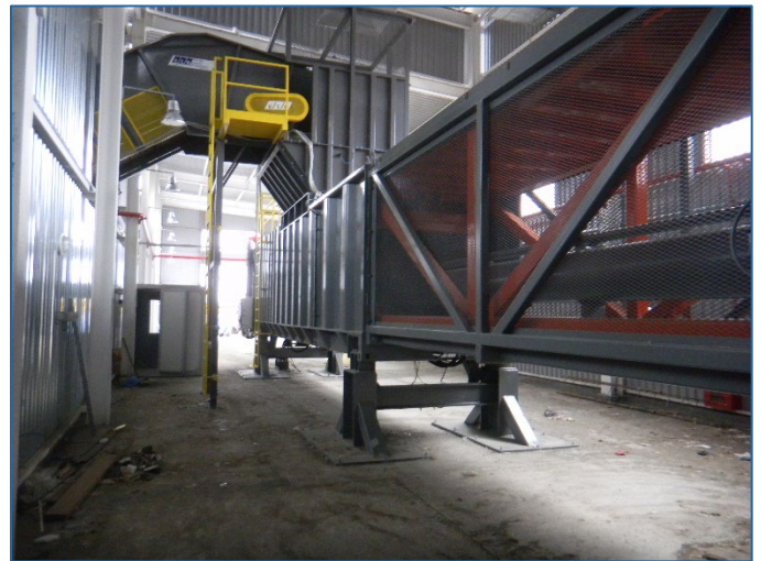
2500 SPH Rear

Note: Installation photos may include optional features & equipment that are not included on this quotation. Please contact SSI with any questions you may have.