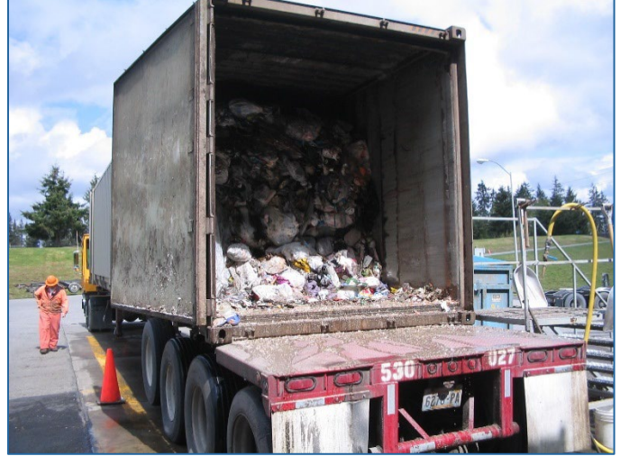
Ejected bale in trailer