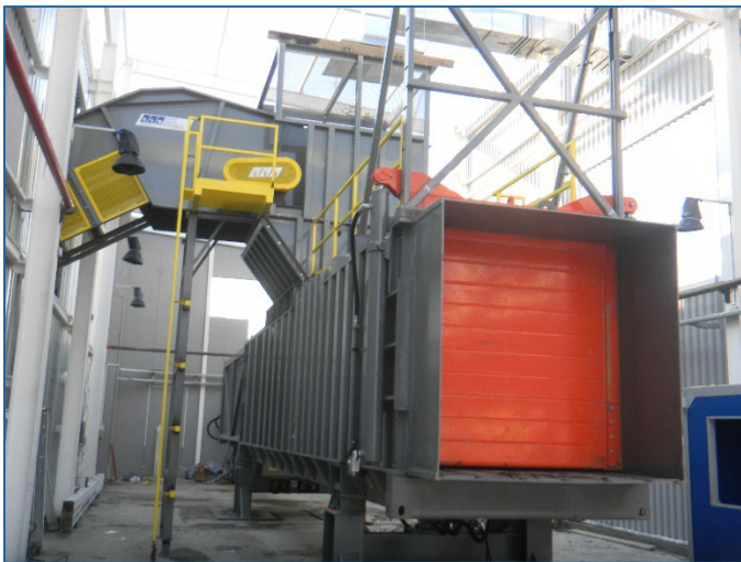
2500 SPH Front