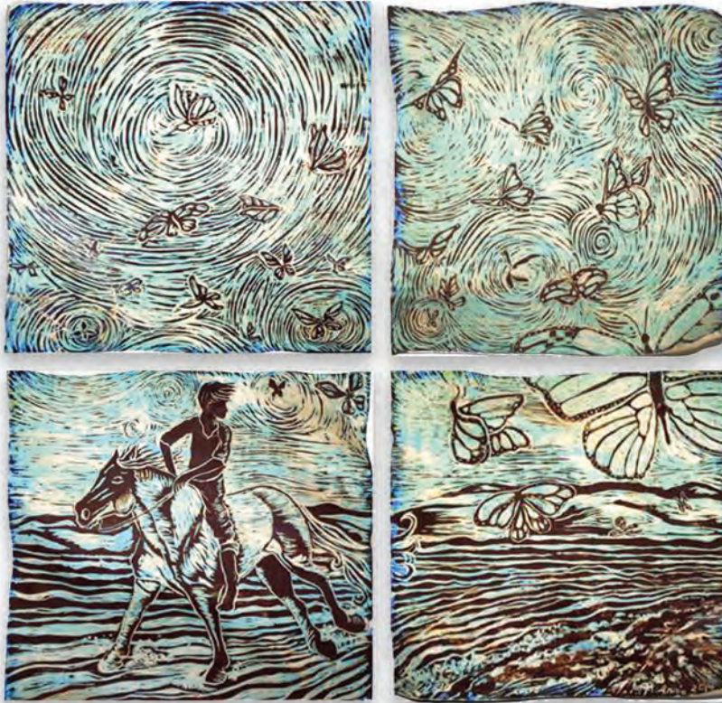
"Monterey" 5" X 5" 8 Large Tiles