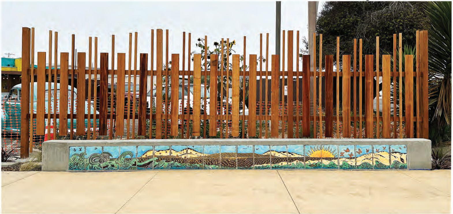
Oceano Plaza Park Ceramic Tile 20' Bench July 2024