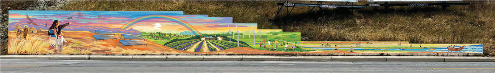
“Higuera Street Wall Mural” 2024