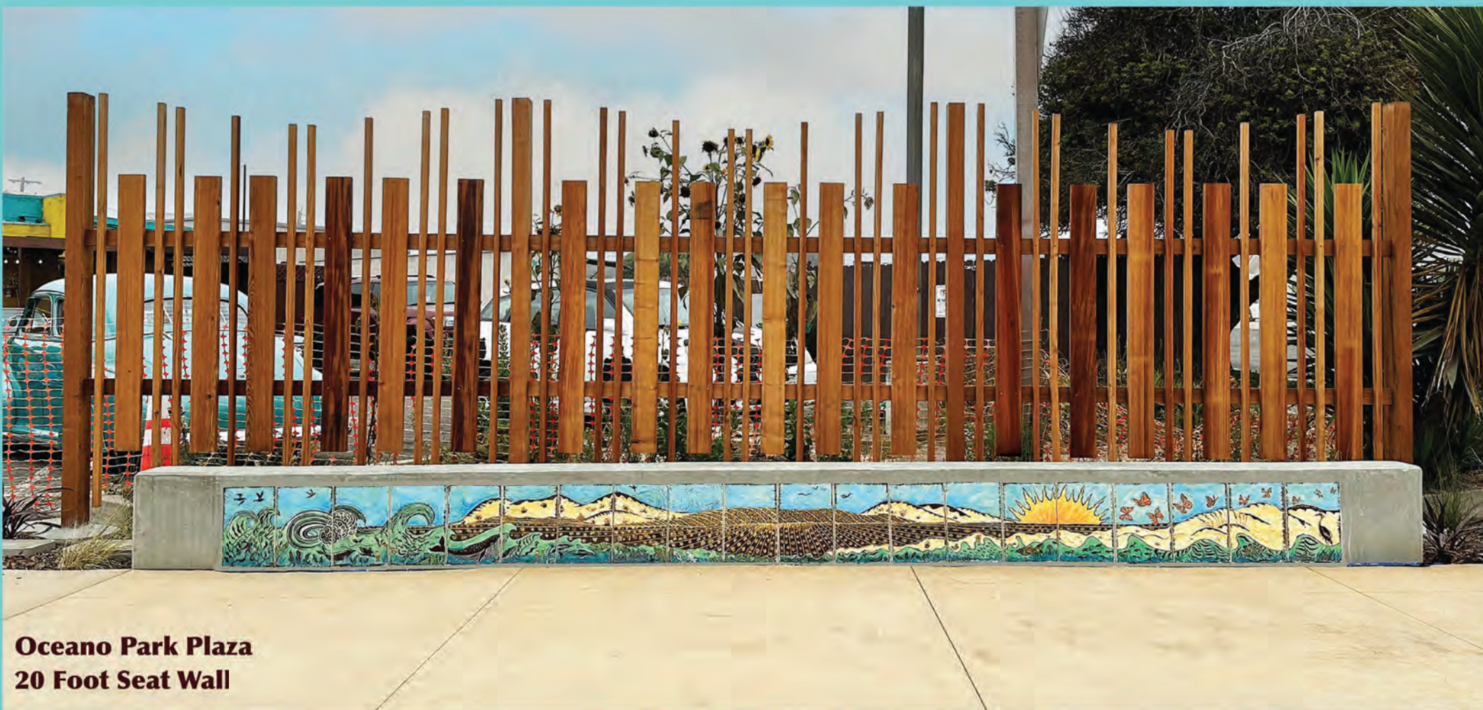
Oceano Park Plaza 20 Foot Seat Wall

Materials and construction plans made available through CalTrans engineers for this project.