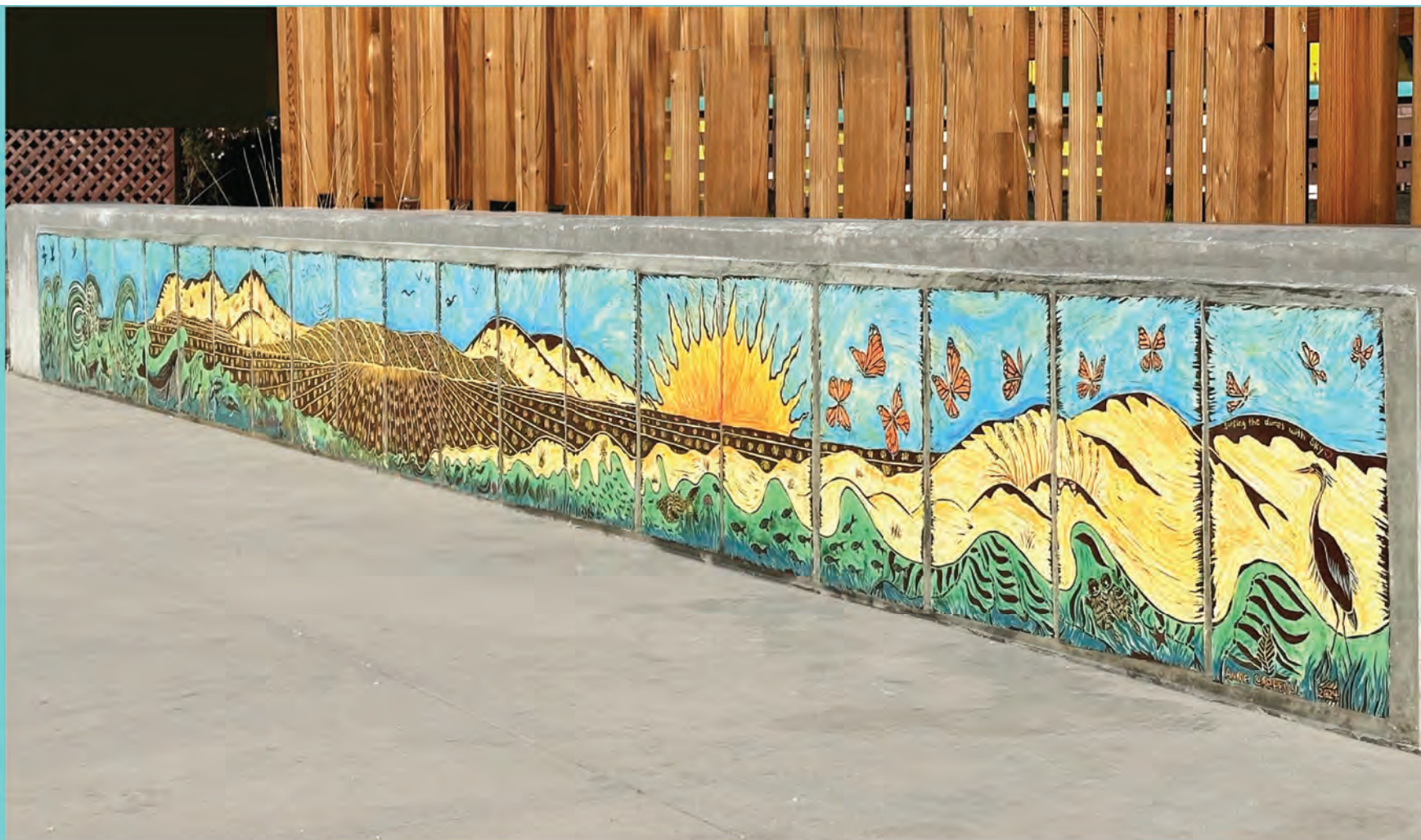
Oceano Park Plaza 20 Foot Seat Wall

With a proven material list for adhering tiles, grout and finish supplied by CalTrans who commissioned this piece.