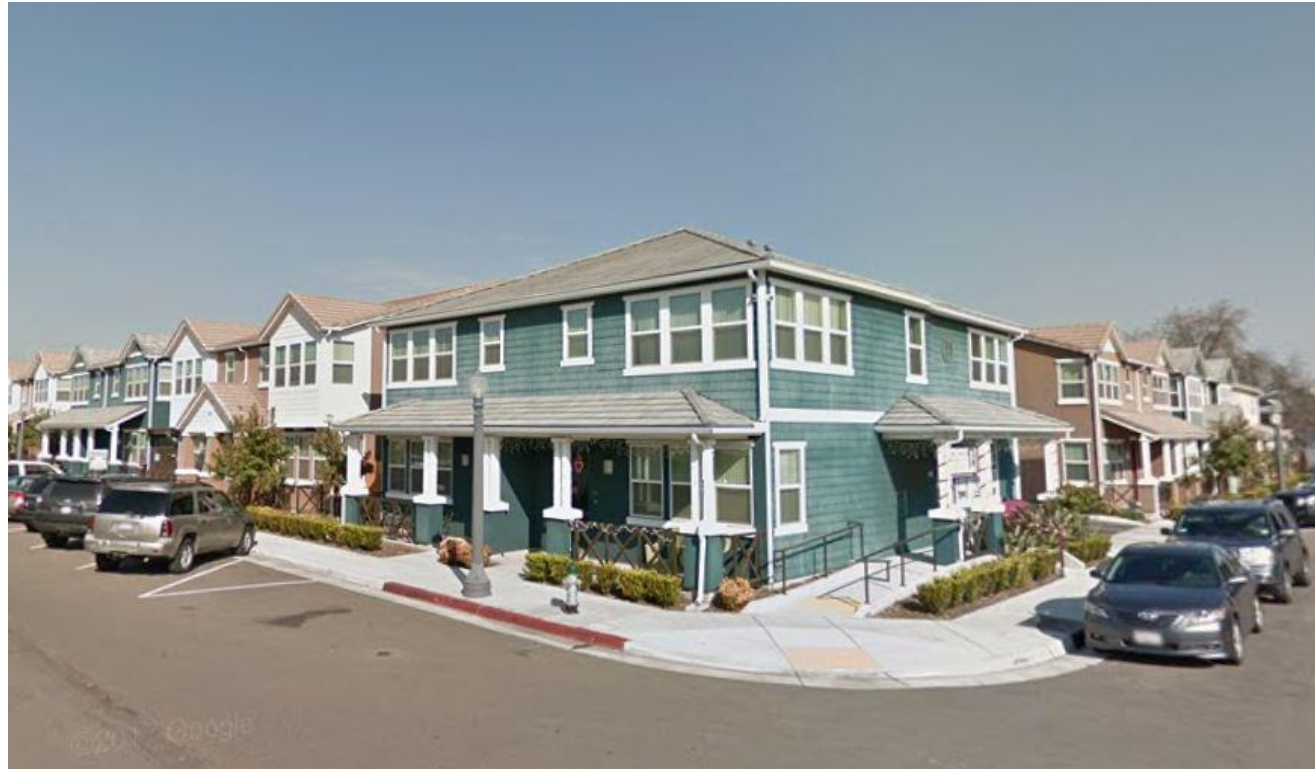
L Street and San Joaquin St., Fresno, Jan. 2017