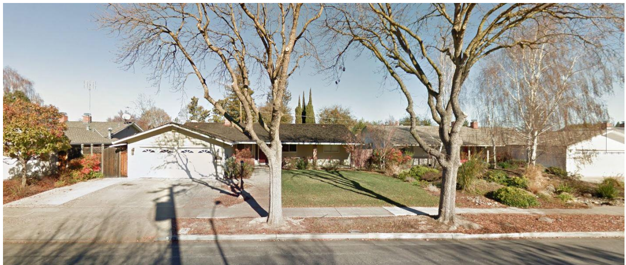
Figure 4. Similar 1-foot lattice addition to an existing 6-foot tall fence at 743 The Dalles Avenue