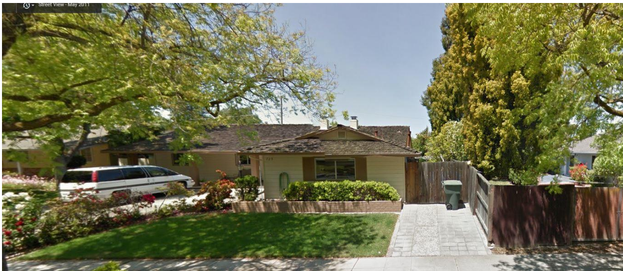
Figure 2. The existing 6-foot tall side yard fence that is located in the 20-foot front setback