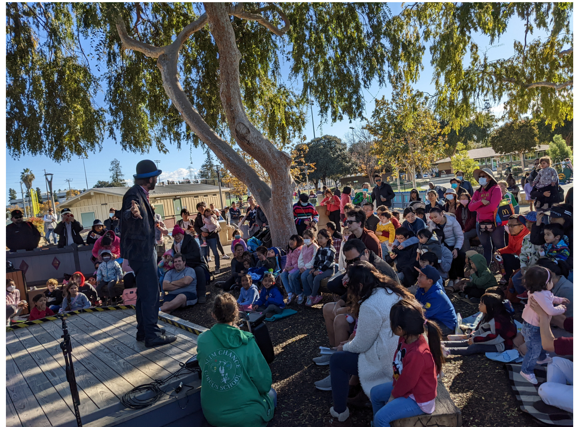
Special Family Programs