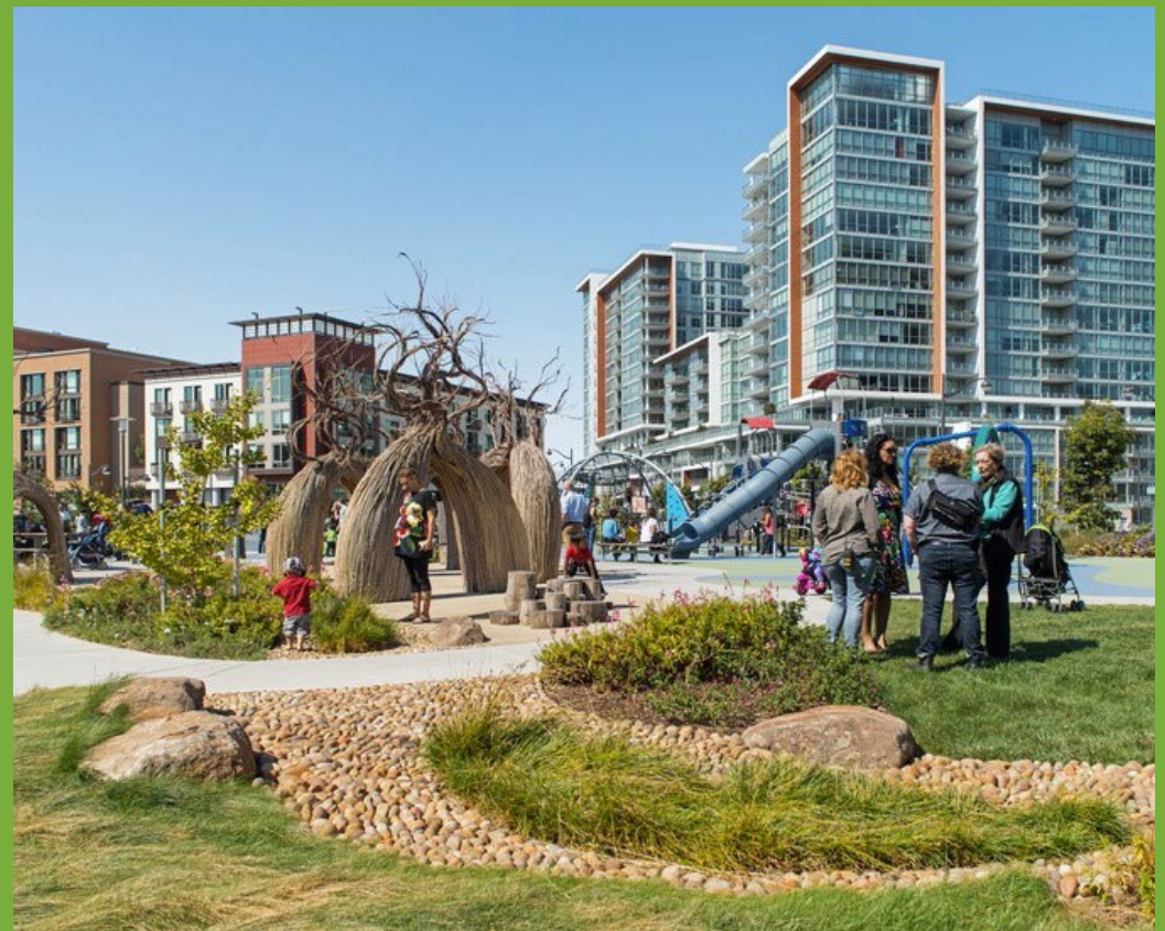
Example rendering of park within innovation district

-The Rise of Innovation Districts Brookings Institute Metropolitan Policy Programs