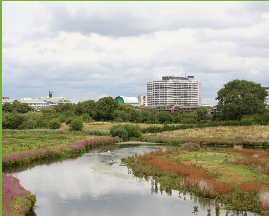
"London Wetlands"