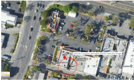
Trash Bin Location view from above.jpg 402K