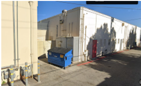
Trash Bin Location in Alley.png 901K