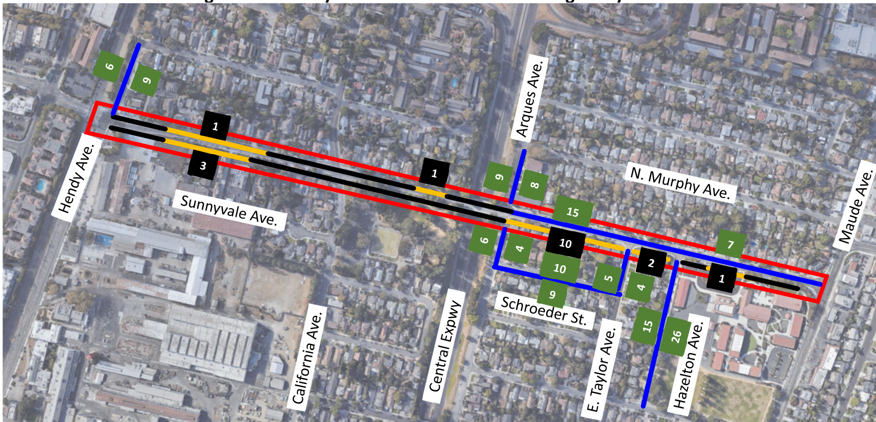
Figure 5.3 - Sunnyvale Avenue On-Street Parking Study – 1 a.m.