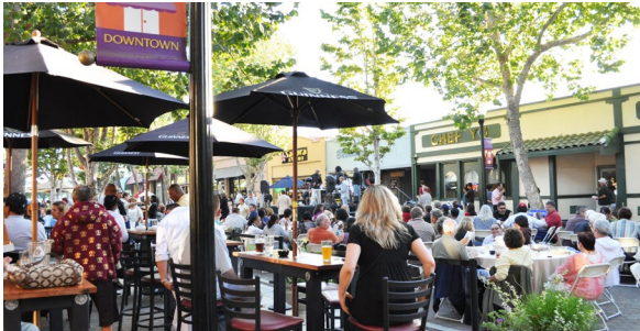
Murphy Avenue in Sunnyvale

To achieve the vision for an ecological innovation district, the Guiding Principles offer more specific direction regarding how strategies and activities within Moffett Park can be implemented over time. The principles connect the overarching vision with the Specific Plan’s goals, policies, actions, and development standards. These principles establish a reference point for stakeholders and decision-makers as projects are reviewed. These principles offer an opportunity to not only build on current conditions but to adapt and respond to new issues that will emerge in the future.