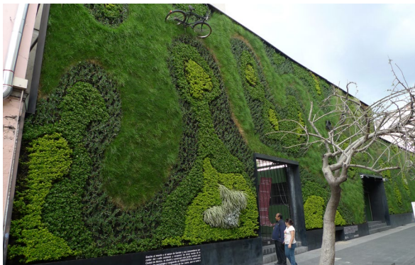
"Mexico City Greenwall"

change. Additionally, new developments enhance ecosystems and support biodiversity through bird safe design, an Ecological Combining District, a transfer of development rights policy, and increased building setbacks along the East, West, and Lockheed Martin Channels. Infrastructure improvements and both active and passive strategies at the site and building level provide opportunities to manage stormwater and future challenges associated with climate change and sea level rise.