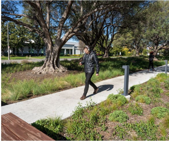
Tree canopy over walking path; Source: Shira Bezalel, San Francisco Estuary Institute (SFEI)