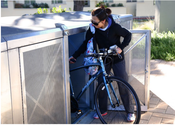
Long term parking