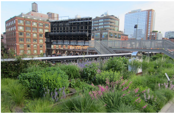
“High Line, New York City”

essential to improving circulation and overall connectivity. These would include Mary Avenue Overcrossing, East Channel Trail, and a Multi-Use Path on Manila Drive. Moffett Park supports existing operations of public transit and facilitates opportunities for expansion and new connections like the Moffett Park Circulator. An emphasis on walking, biking, and transit use shifts travel away from single-occupant vehicles and promotes lower greenhouse gas emissions.