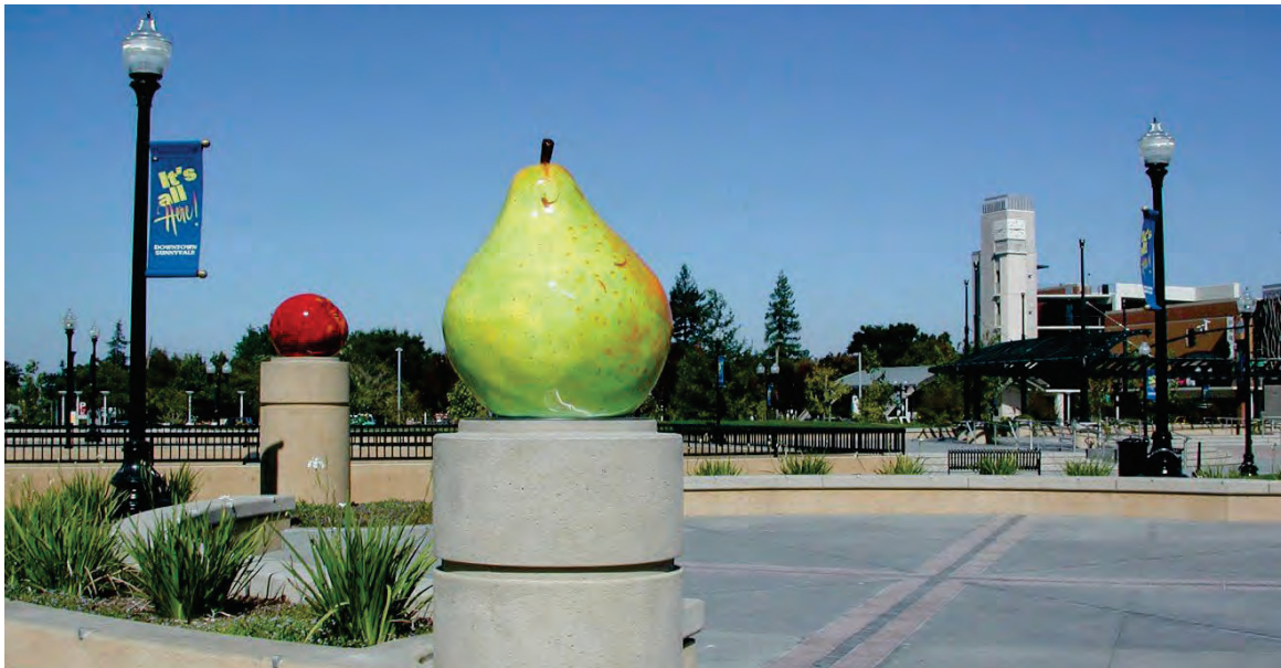
Fruit Gigantica by Gerald Heffernon (2002). Painted Aluminum. Plaza del Sol, 200 W. Evelyn Ave.