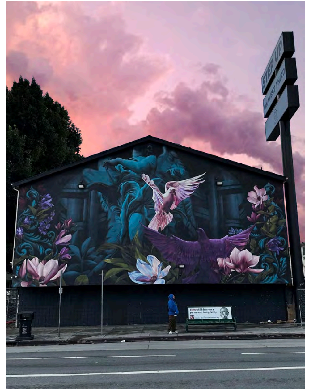
Right: Transition 2, Shangri-La Industries, Los Angeles CA, $56,000, 2023, 26'H x 38'W, spray paint, latex Artwork for senior homeless housing featuring uplifting bird and angel motifs