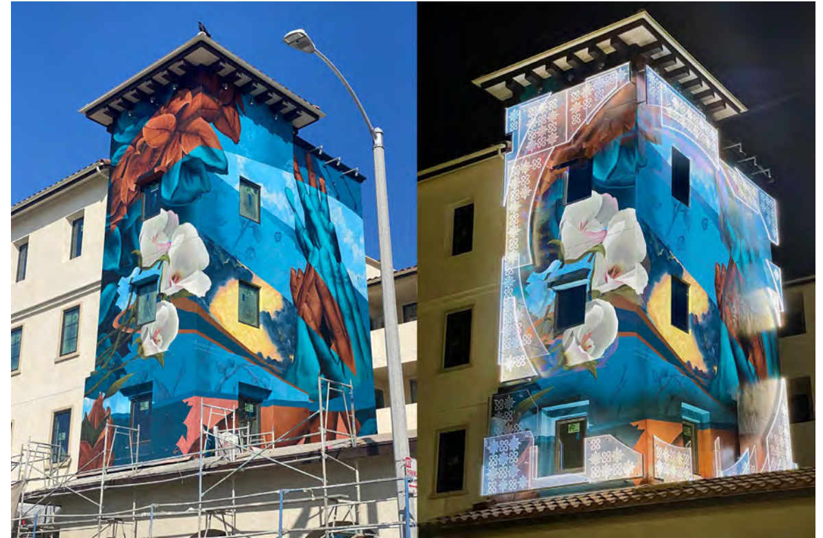
Left: The Majestic, Tulsa Agency for Economic Opportunity, Tulsa OK, $225,000, 2021 65'H x 260'W, Augmented Reality (AR), spray paint and latex Holds the world record for the largest Augmented Reality mural.