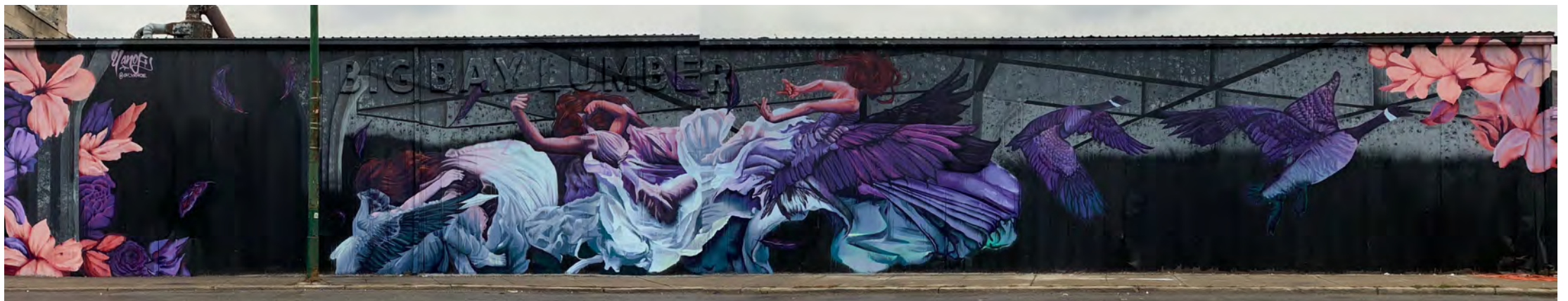
Bottom: Transformation, City of Chicago IL, $60,000, 2022 27'H x 105'W, spray paint, latex, clear coat A visual ode to uplifting the community, fostering growth and inspiring positive transformation.