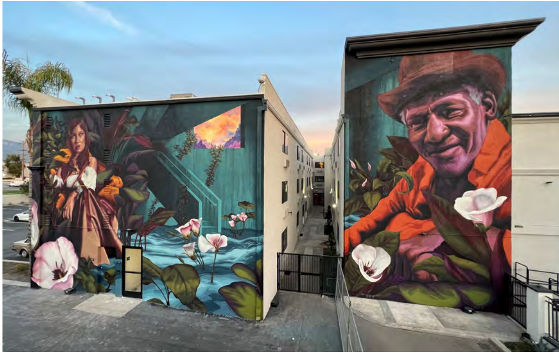
Left: Transition 1, Shangri-La Industries, San Bernadino CA, $74,000, 2023, 34'H x 54'W, spray paint, latex Captures the transition to permanent housing for senior homeless individuals.