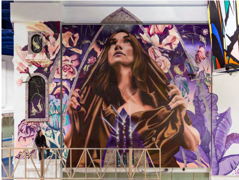
Top: The Ceremony, Prizm Outlets, Primm NV, $20,000, 2019 46'H x 54'W, spray paint, latex Mural was part of $2.1M art renovation project showcasing 120 murals painted by 33 international artists.