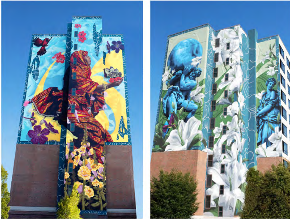
Left: The Journey, Short North, Graduate Hotels, Columbus OH, $150,000, 2019, 220' H x 120'W, augmented reality (AR), spray paint and latex Depicts integration of Somali and American symbolism of strength, resilience and abundance.