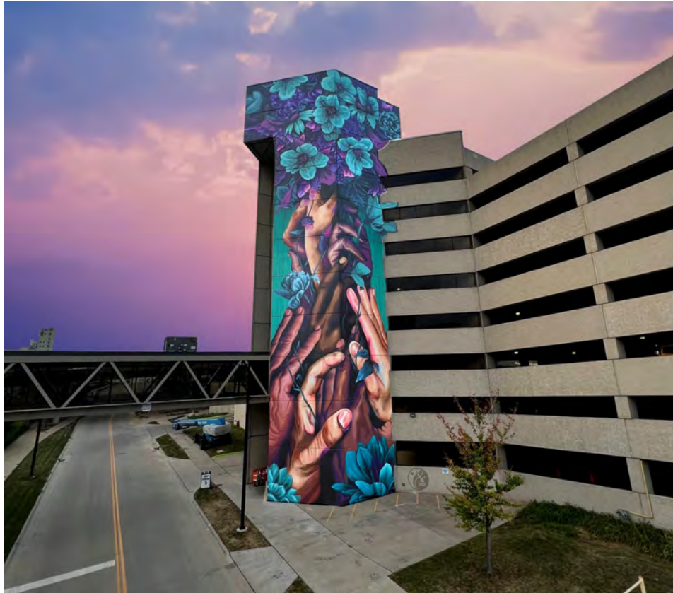
Top: Together We Bloom, City of Cedar Rapids IA, $50,000, 2022 140'H x 55' W, spray paint, latex, clear coat When united, the community blossoms.