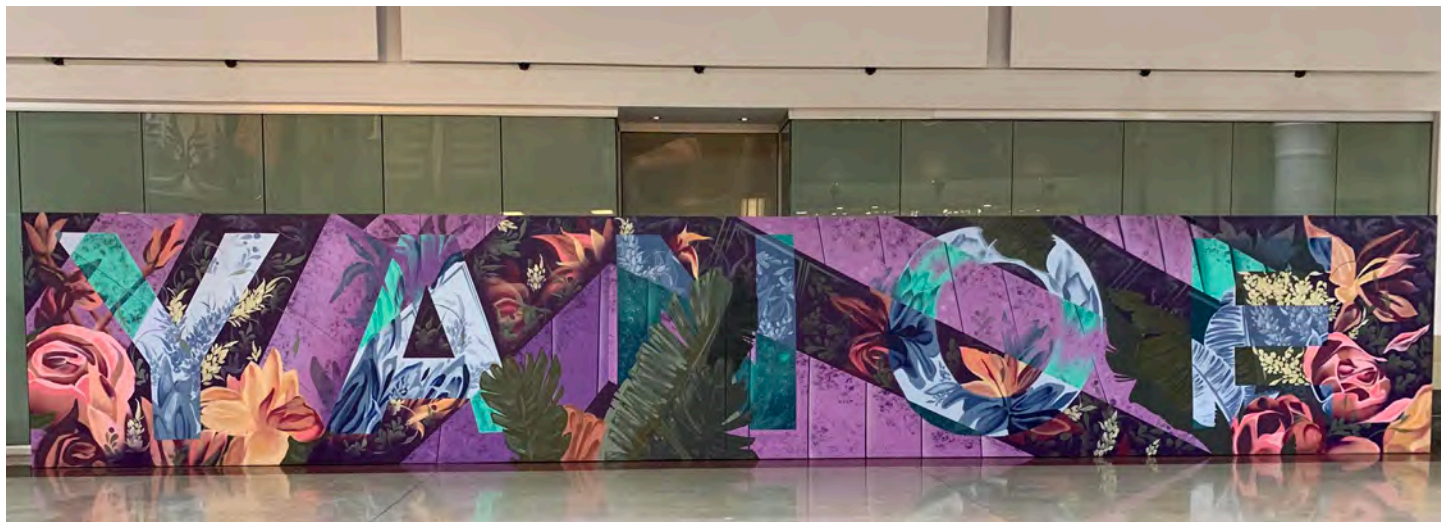
Bottom: Brutalist II, Prizm Outlets, Primm NV, $20,000, 2019 10'H x 63'W, spray paint, latex Nature-themed typography seamlessly woven into a brutalist- inspired pattern.