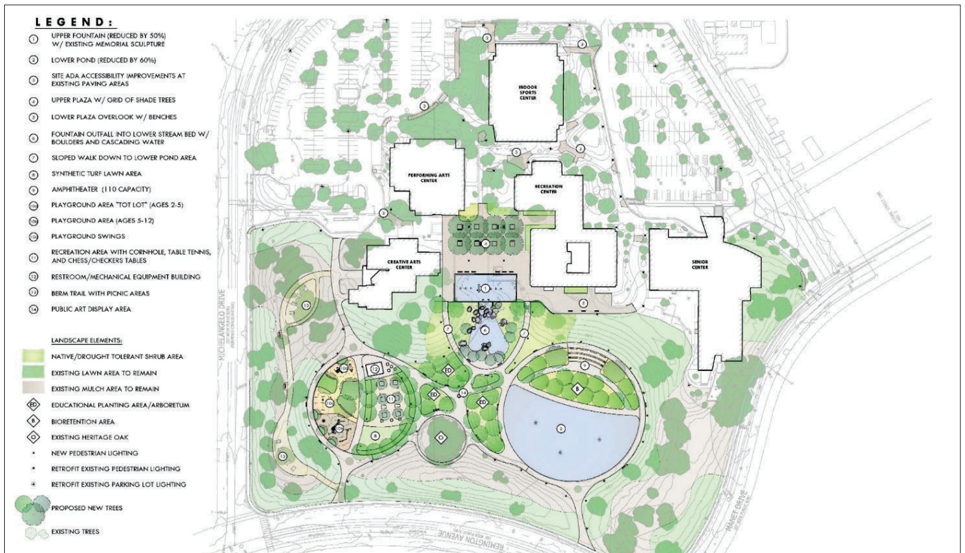
Planned Renovation of Community Center Grounds