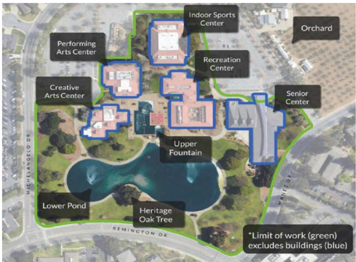
Site Plan – Existing Community Center Grounds (currently under construction)

The City of Sunnyvale Public Art Program seeks to commission an artist, or artistic team, to design and execute an original sculpture design for the Community Center Grounds in Sunnyvale, CA (550 E. Remington Drive).