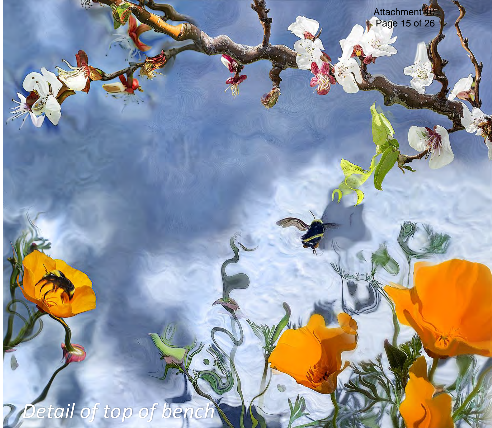
Detail of top of bench

These visual echoes of growth and transformation are especially resonant for a public park rooted in agricultural history and reimagined as a vibrant communal space.