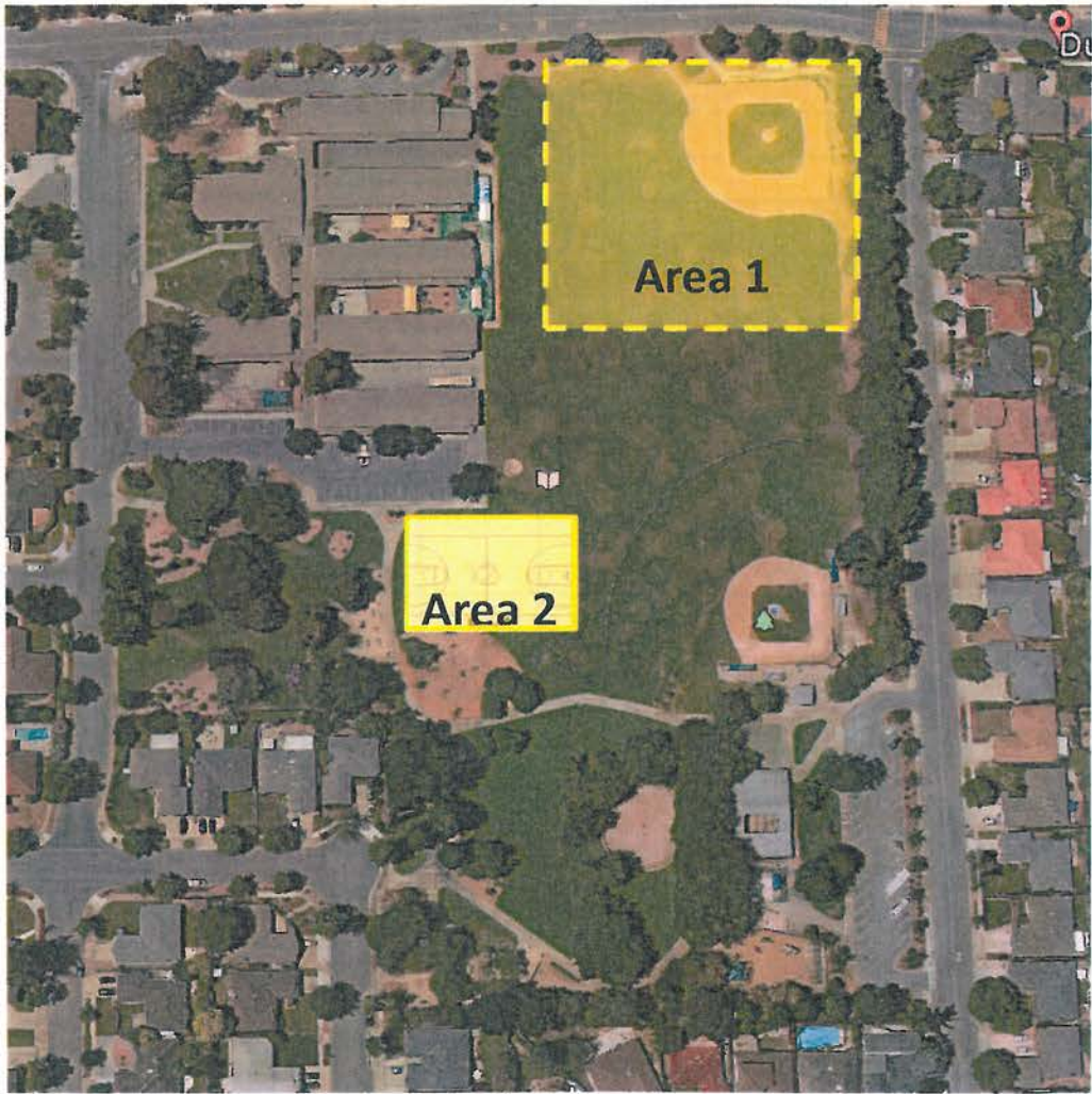
Figure 3. Park use areas.

(j) Stratford shall maintain liability insurance equal to $2,000,000 during the life of this agreement.