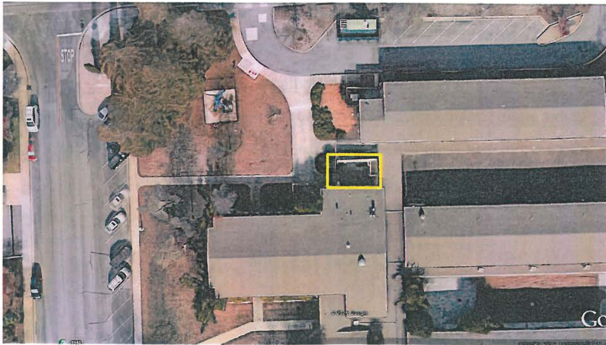
Figure 2. Location of Bike Corral.

* Carpool participants who have signed up through Stratford Share-a-Ride program.