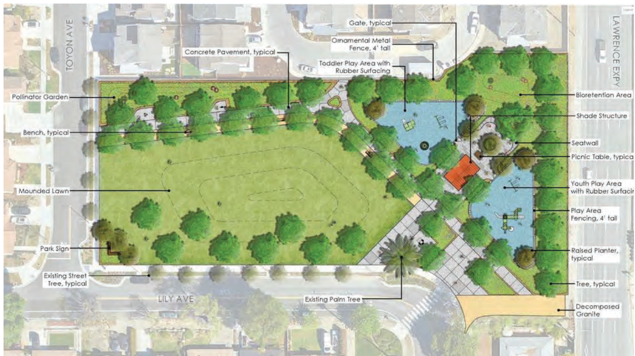
Image: Corn Palace Park, Approved Concept Design Plan

The City of Sunnyvale's Art in Public Places program seeks to commission artists, or artistic teams, to design and execute original works of art for the new Corn Palace Park. There are four opportunities for art for this project: three backless artist created benches and a mosaic seating wall.