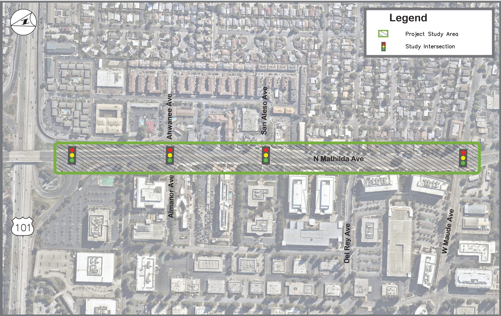
SB Mathilda Avenue Bike Lane Study from US 101 SB Off-Ramp to Maude Avenue