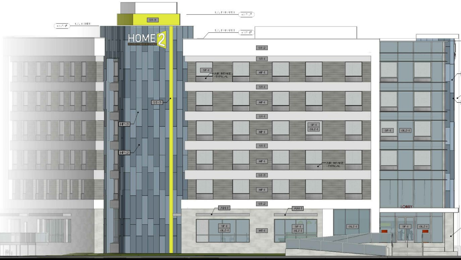
View from Lawrence Station Road