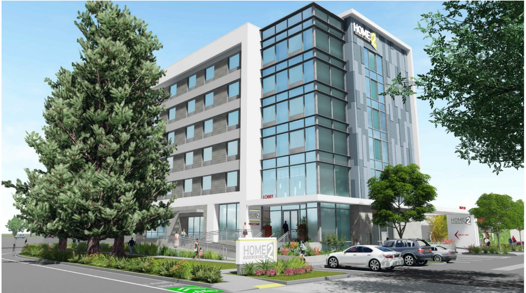
View from Lawrence Station Road