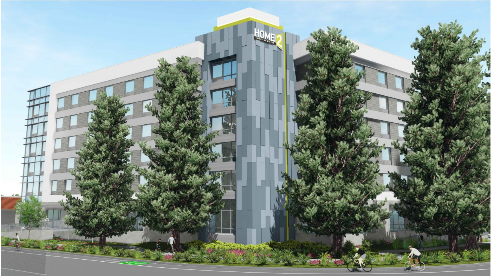
View from street corner