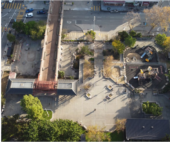
Aerial view of Portsmouth Square in Chinatown, San Francisco CA