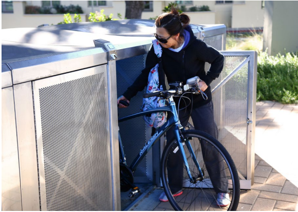
Long term parking