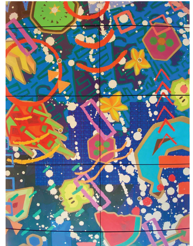
Work sample using stylized fruits and wide range of pattern designs.