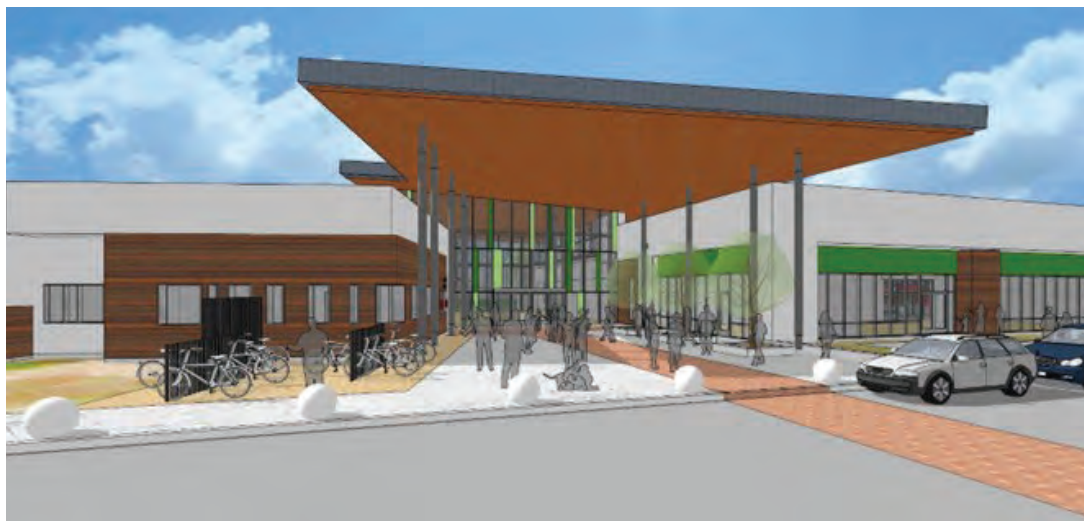
Elevation Drawing – Lakewood Branch Library and Learning Center Main Entry

The City of Sunnyvale's Art in Public Places program seeks to commission artists, or artistic teams, to design and execute original works of art for the new Lakewood Branch Library and Learning Center (LLLC). There are two locations available for this project: a primary wall below the clerestory windows on the interior of the building and the exterior forecourt, parking lot and main entrance areas.