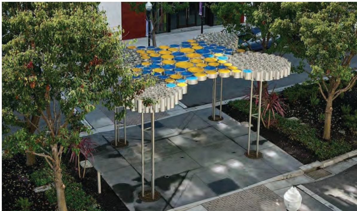
One Thousand Suns (2022) by Future Forms. Mixed media shade structure, McKinley Avenue median downtown Sunnyvale.