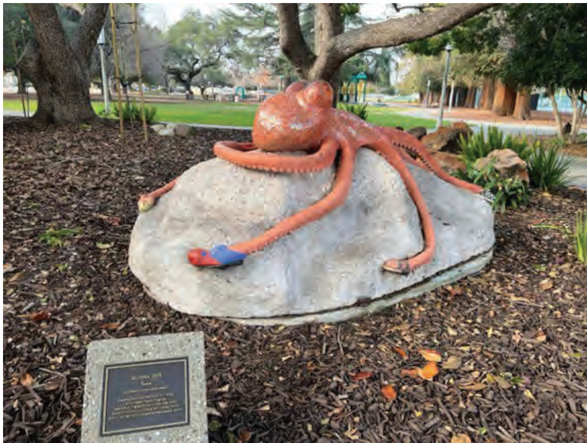
Octopus (2022) by Fadducci, sculpted concrete, Washington Park

The entry, forecourt and parking lot areas of the facility offer several opportunities for public art, including hardscaping, smaller sculptural elements, a monumental work of art, functional or interactive art and paving. The budget for these areas is $135,000 all inclusive. Artists may choose to use all or some of these areas.