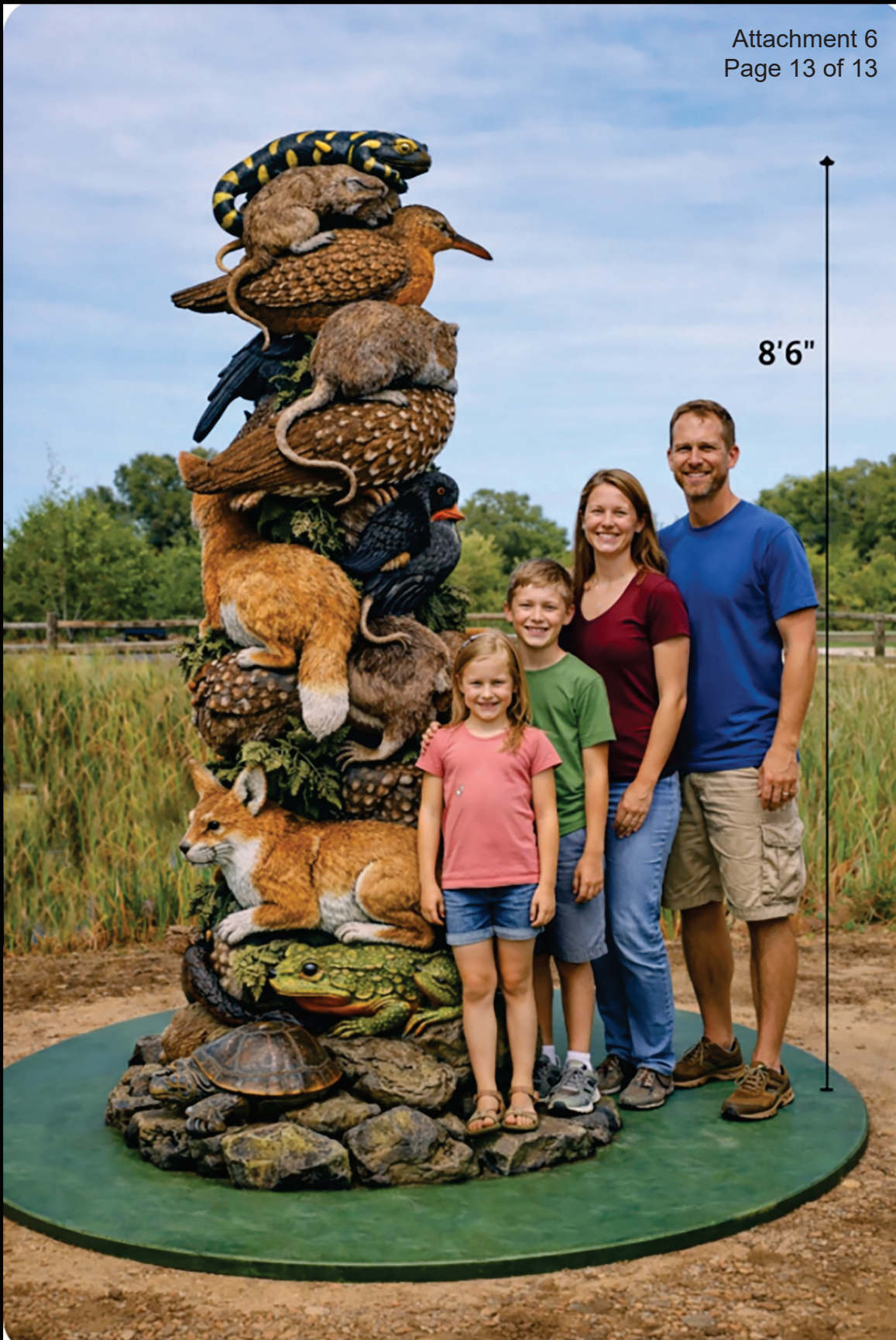
Faducci Proposal for Sunnyvale Community Center