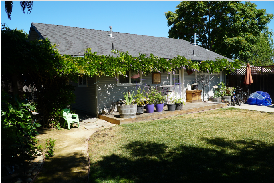
Figure 4. Looking northwest at south and east sides of former garage, 6/12/18.