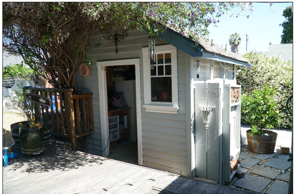
Figure 3. Looking northwest at south and east sides of washhouse, 6/12/18.