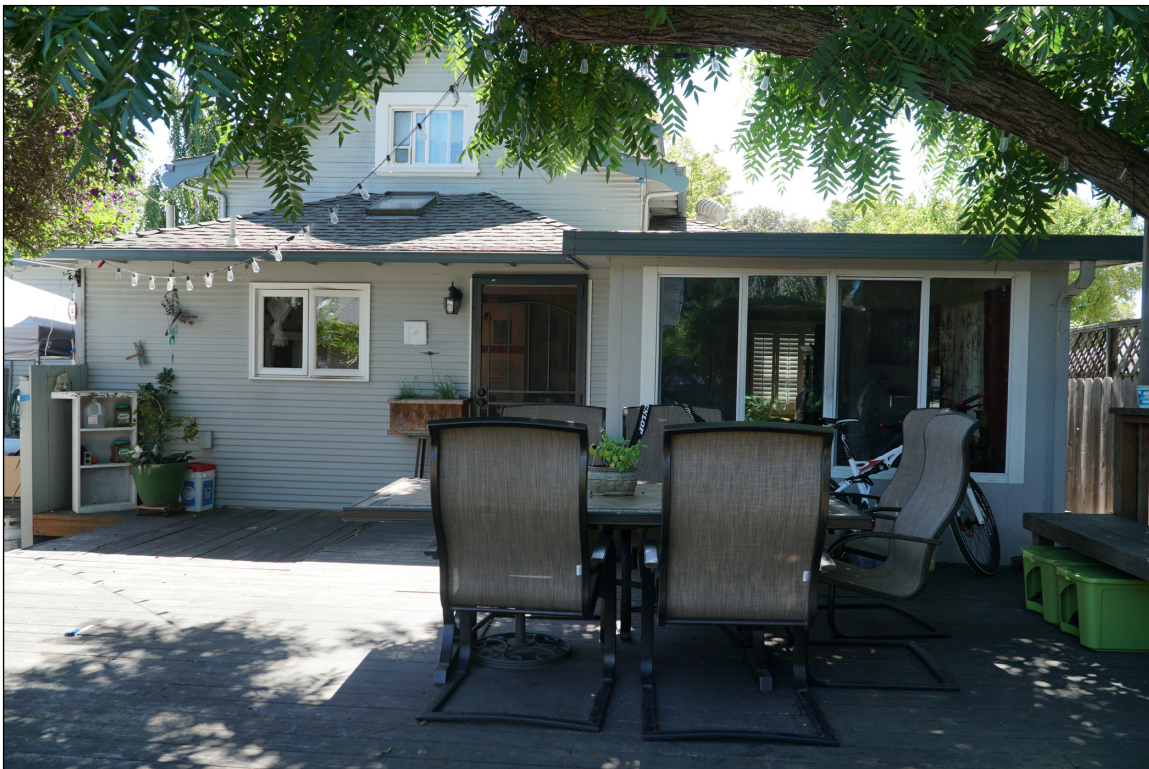
Figure 1. Looking east at west side, 6/12/18.