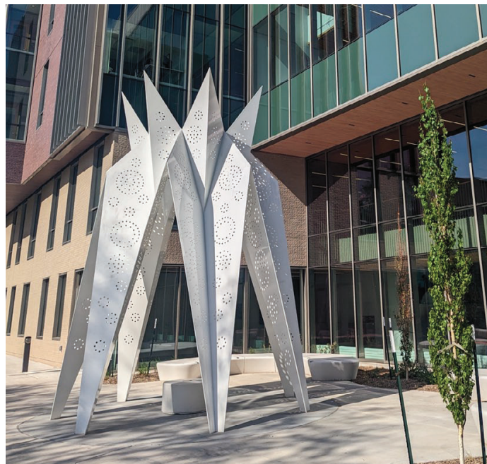
T.I.E. - 2022 College of Education, University of Nebraska, Lincoln