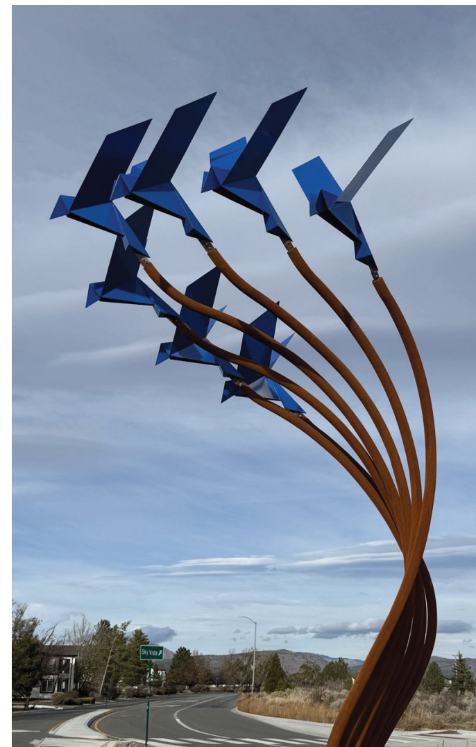
Chur Chur - 2025 North Valleys Regional Park, Reno, Nevada