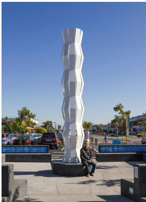
Of Two Lineages - 2017 Little Saigon, Westminister, Calif.

His work centers on exploring the emotional and cultural histories of a site, translating stories into evocative visual languages that foster reflection and connection. Whether honoring collective experiences or elevating overlooked narratives, Dinh’s projects invite viewers to engage with public space in meaningful and transformative ways.