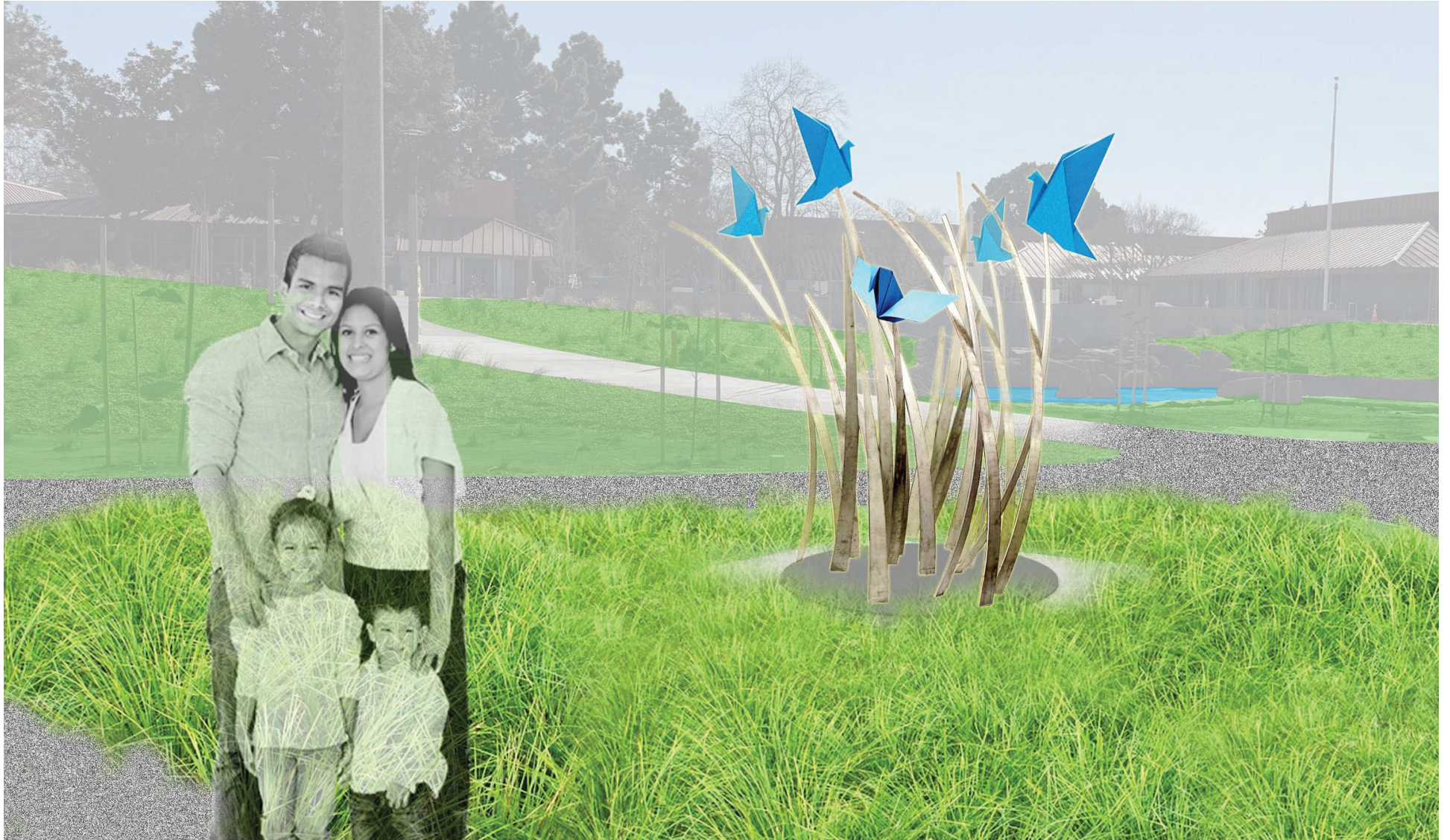
SUNNYVALE COMMUNITY CENTER GROUNDS SCULPTURE