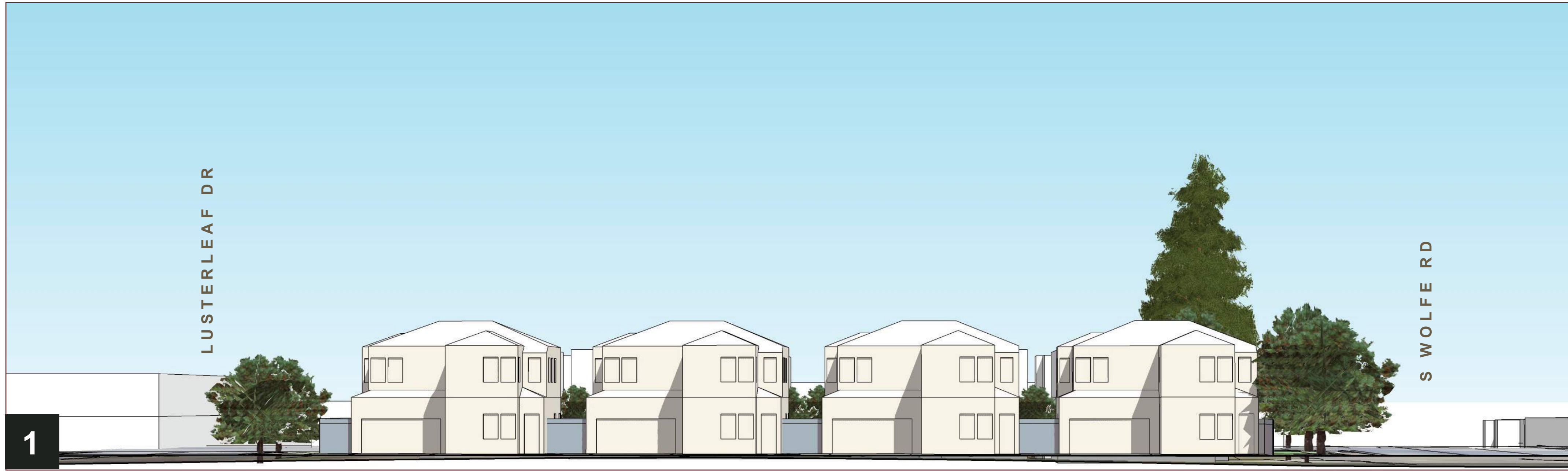
CONCEPTUAL STREETSCAPE FROM CENTER OF DRIVE AISLE LOOKING NORTH