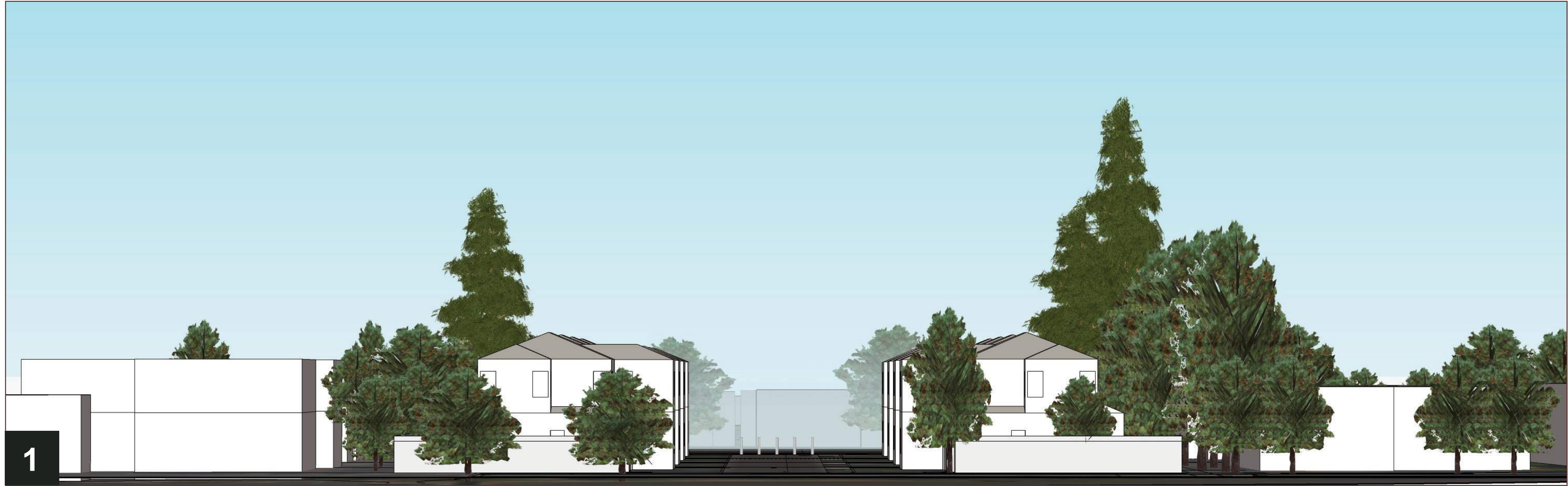
LUSTERLEAF CONCEPTUAL STREETSCAPE