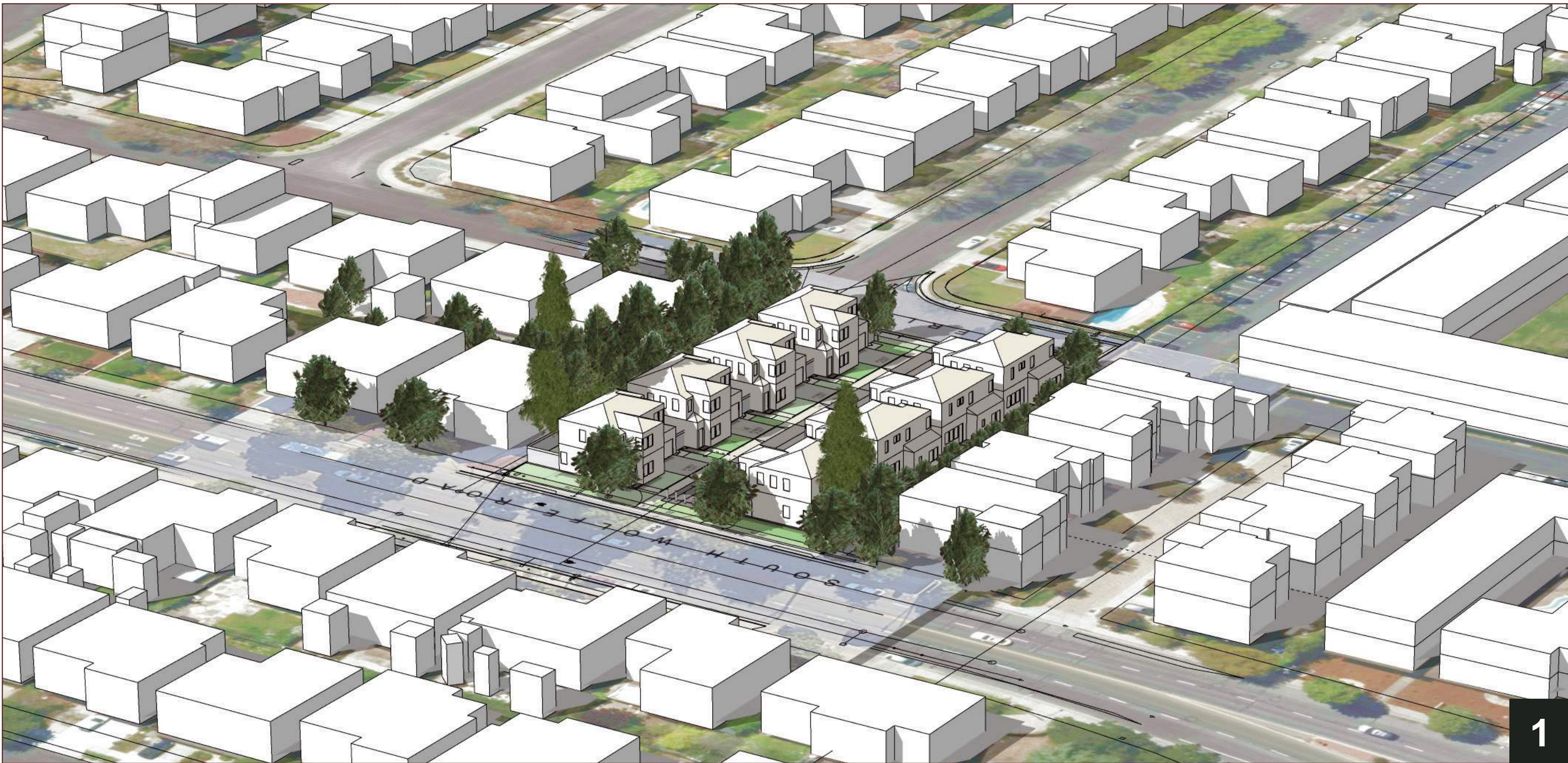
CONCEPTUAL MASSING DIAGRAMS WITH CONTEXT

781 S. WOLFE ROAD - SUNNYVALE, CA CALIFORNIA COMMUNITY DEVELOPMENT