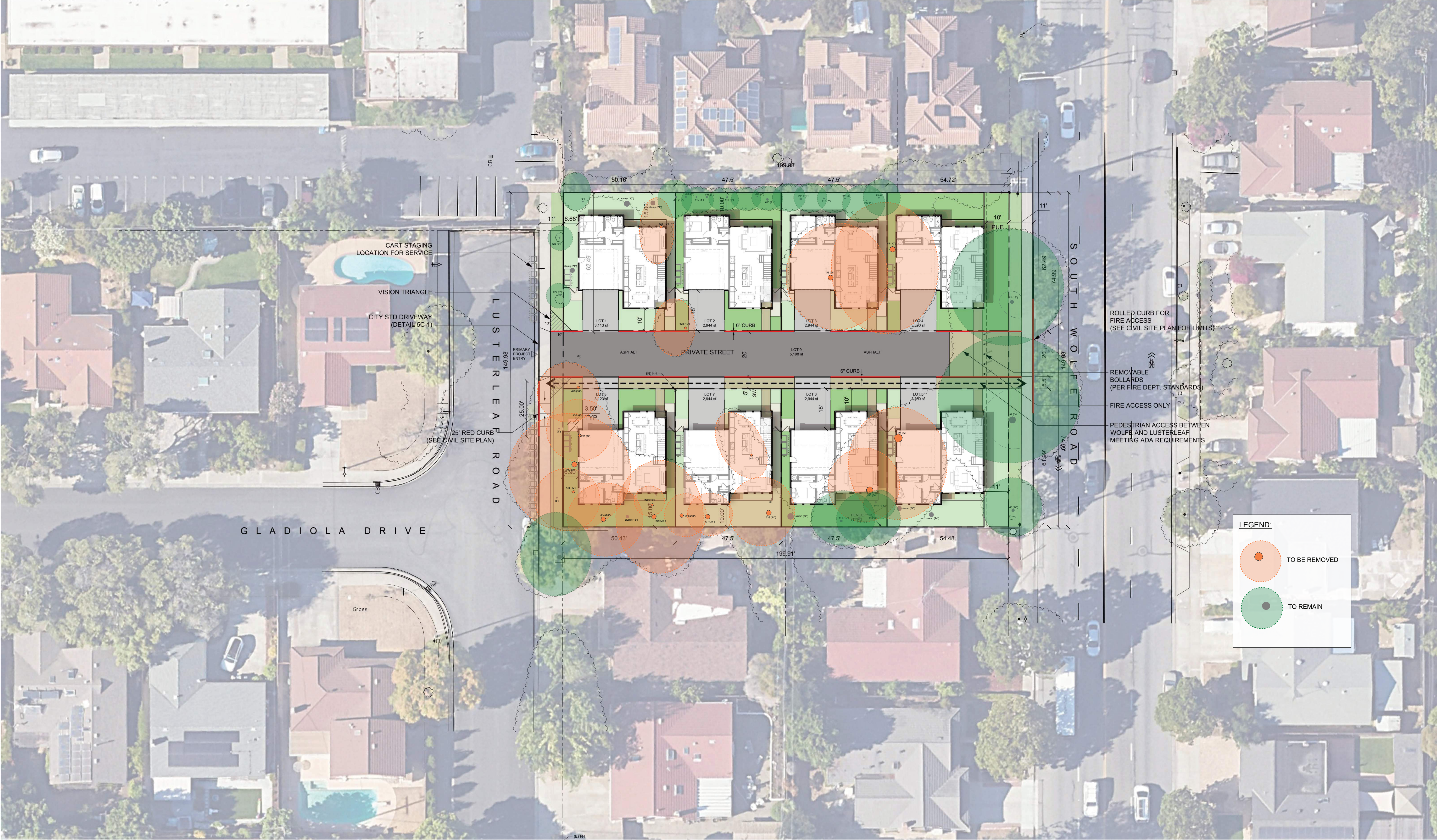
CONCEPTUAL SITE PLAN WITH TREE OVERLAY

781 S. WOLFE ROAD - SUNNYVALE, CA CALIFORNIA COMMUNITY DEVELOPMENT