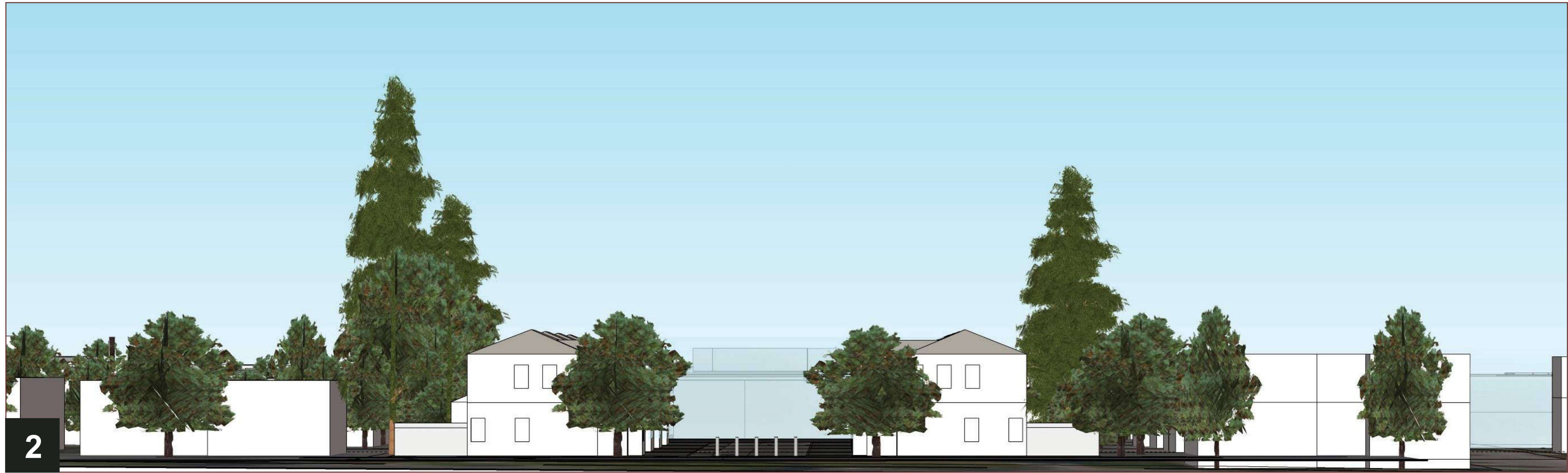
S WOLFE CONCEPTUAL STREETSCAPE