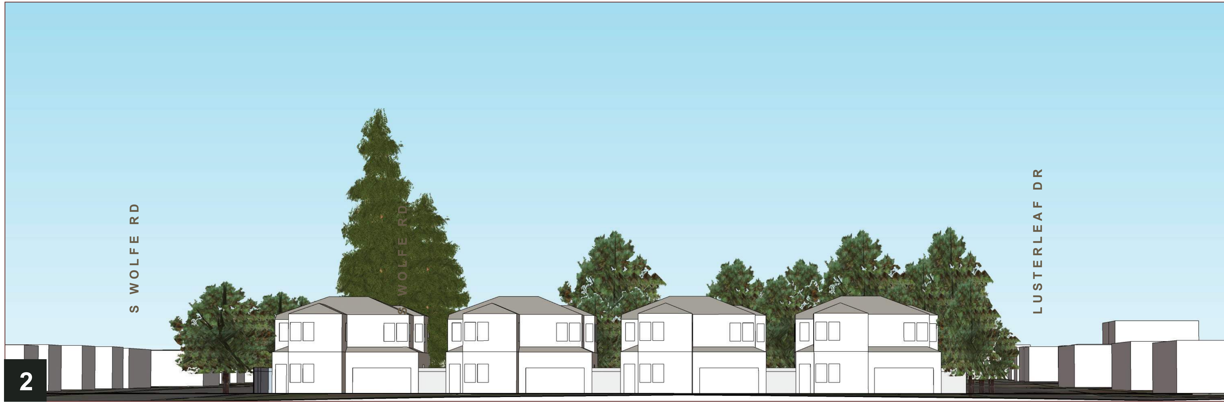
CONCEPTUAL STREETSCAPE FROM CENTER OF DRIVE AISLE LOOKING SOUTH