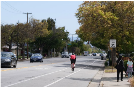
Planned improvements include upgrading existing bike lanes to separated bikeways.