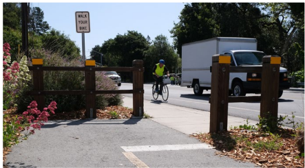
A multi-use path ends abruptly, causing bicyclists to ride on the narrow sidewalk, ride against the flow of vehicle traffic, or cross the road at an unmarked location to get into the proper bike lane.

VTA's Community Outreach (408) 321-7575, (408) 321-2330 TTY vta.org , community.outreach@vta.org