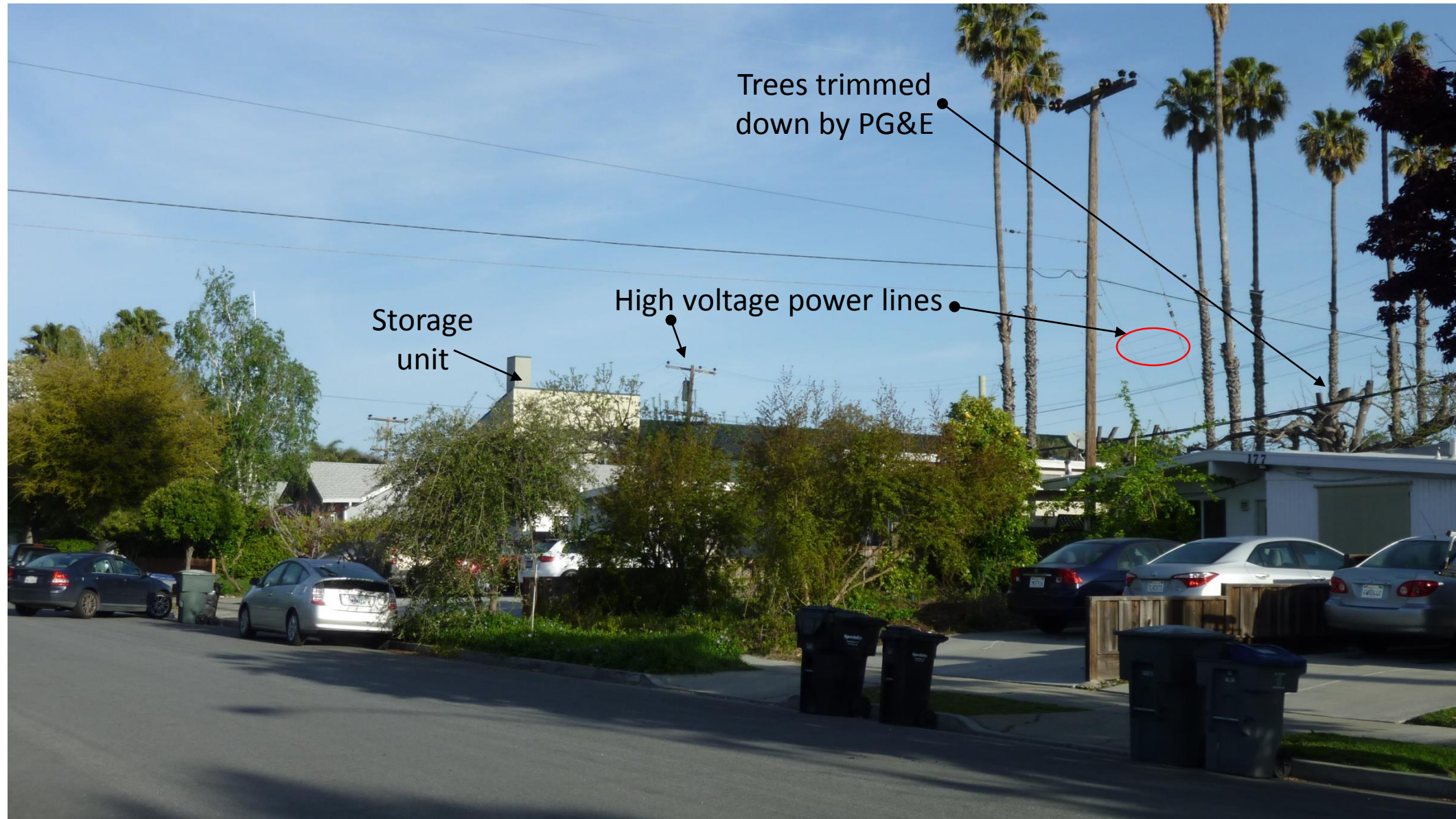
View facing homes backing storage lot, palm trees belong to R4-zoned apartment complex on Ahwanee