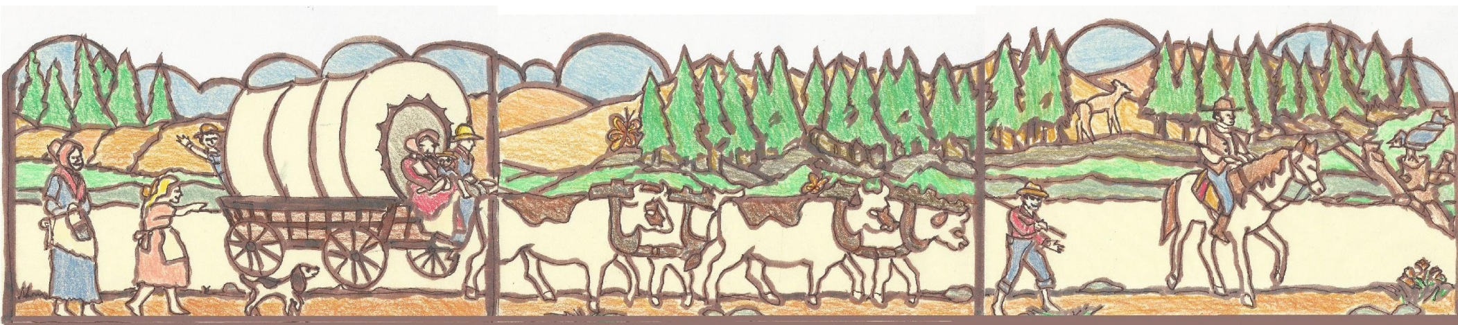
Imagery depicting the Murphys' wagon train journey to Sunnyvale.