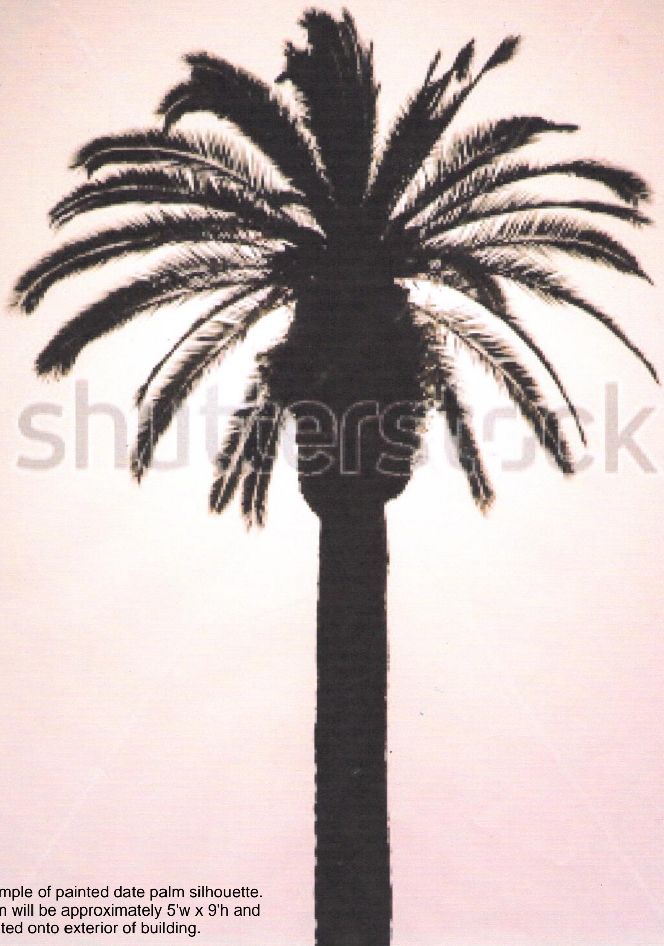
Example of painted date palm silhouette. Palm will be approximately 5'w x 9'h and painted onto exterior of building.