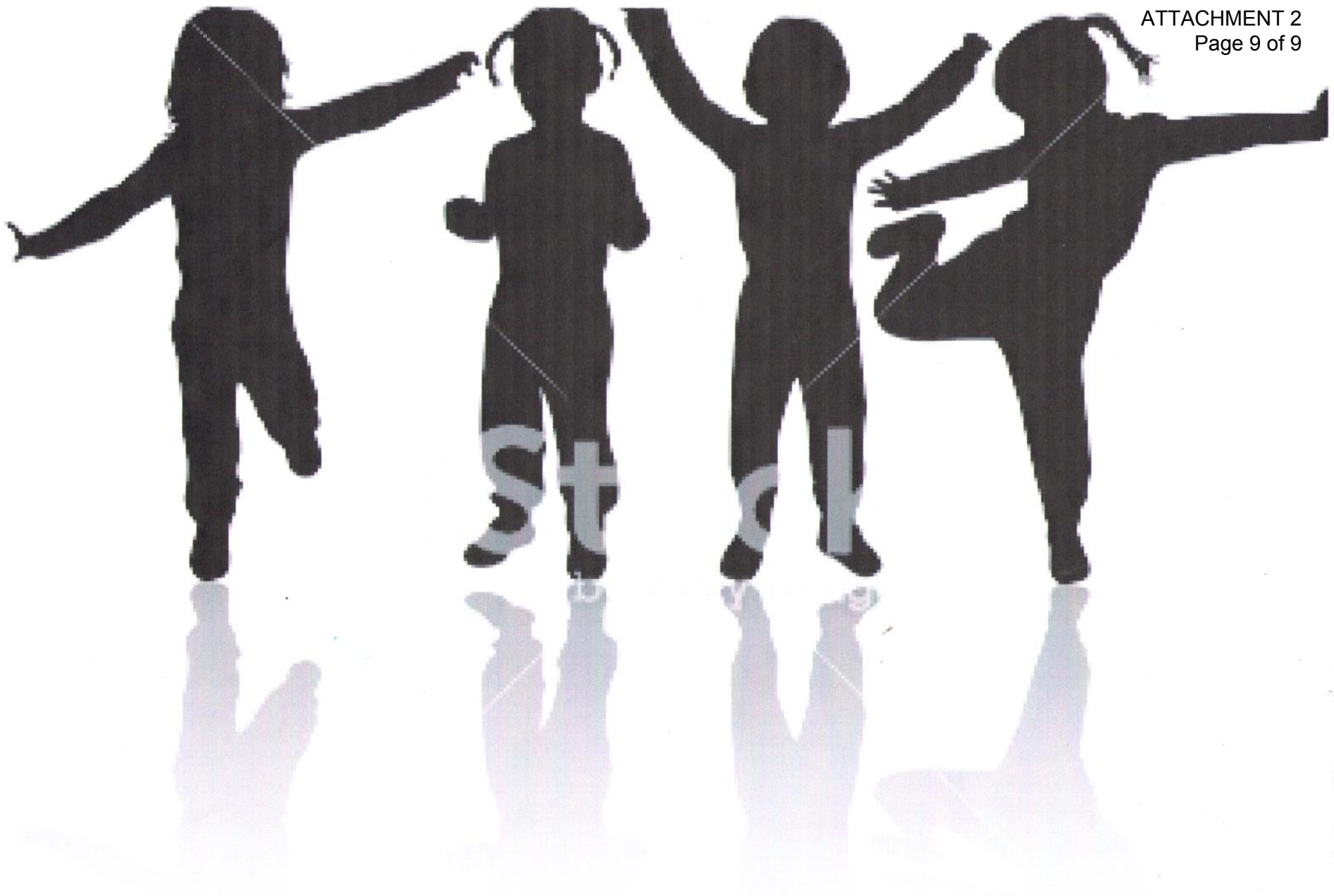
Example of children silhouettes, which will be approximately 5'w x 5'h and painted on the building exterior.