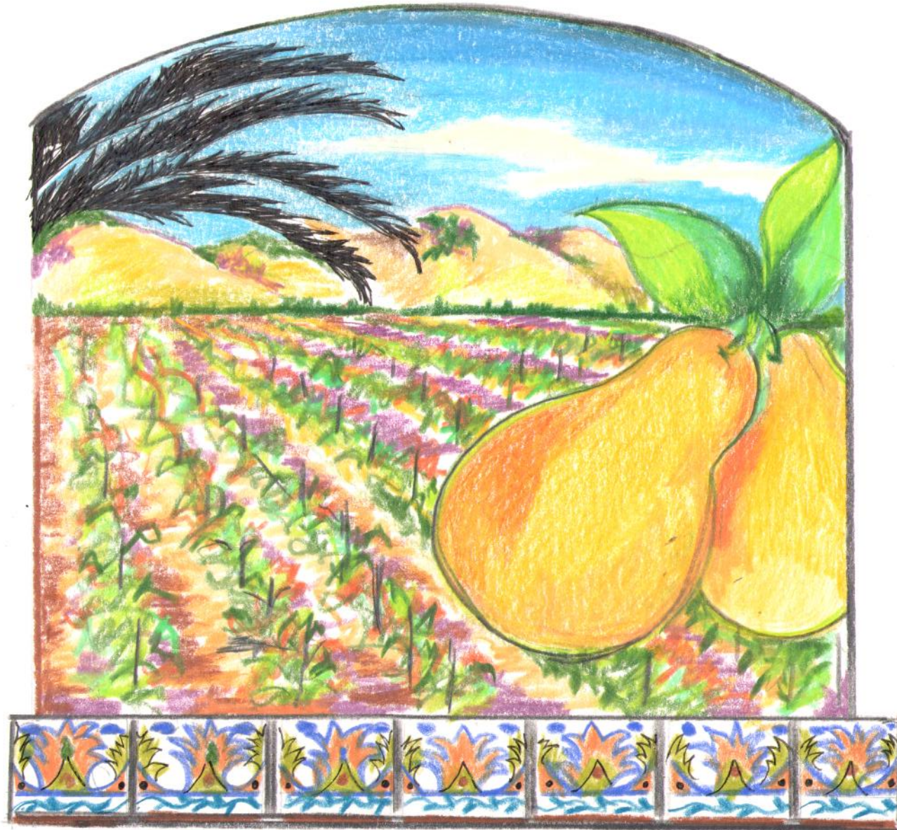
Panel 2 - Illustrates the development of California's vineyards and Sunnyvale's agricultural history.