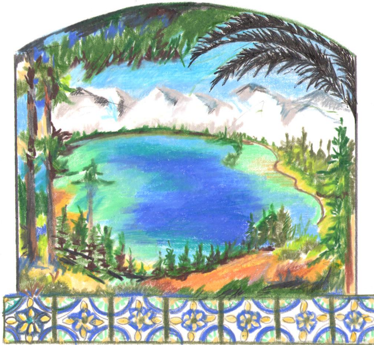
Panel 1 - Illustrates the historical account of the Murphy family's journey to California in 1884. The family was among the first settlers to cross the Sierra mountain range.