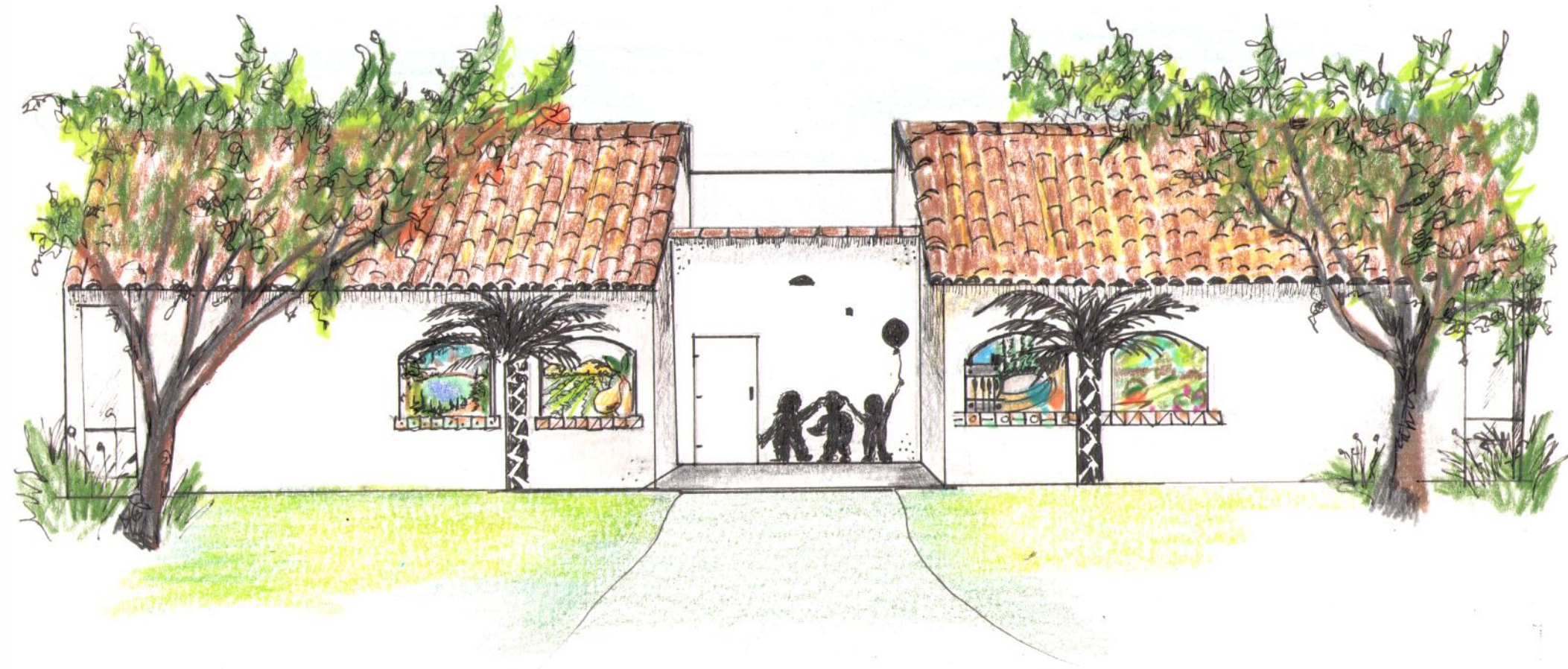
Elevation rendering of Anderson's design proposal. Each of the four panels will incorporate an arched top and a 'windowsill' of Spanish tiles along the bottom to represent the Mission Revival-style architecture, which was popular during the mid-1800s when the Murphys arrived in Sunnyvale. Each panel will measure approximately 4'w x 4'h and include blue skies, foliage and trees found in the park (pine, eucalyptus, palm, magnolia, cypress).