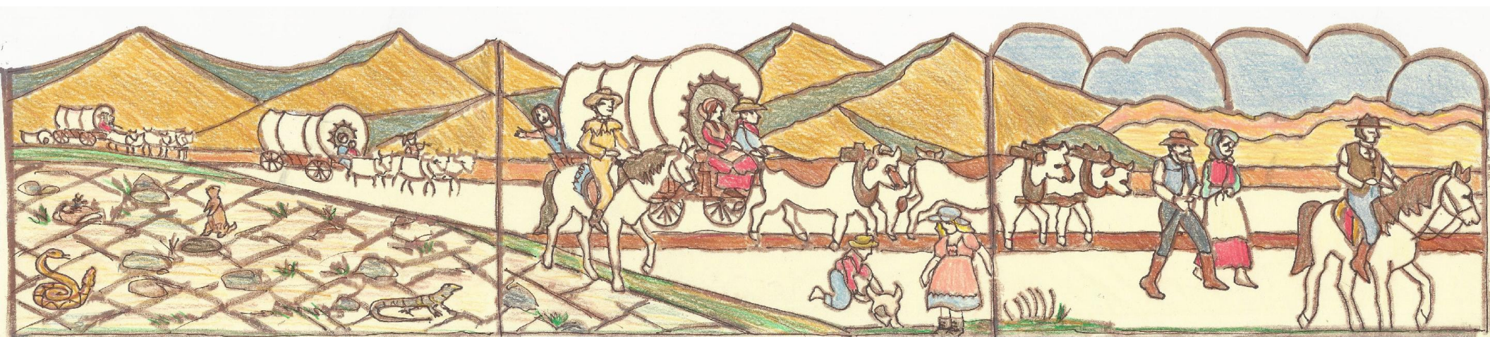
Imagery depicting the Murphys' wagon train journey to Sunnyvale.