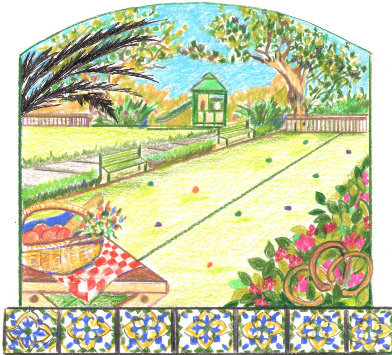
Panel 4 - Illustrates additional park amenities, including picnic facilities, horseshoe pits, park benches, play structure and lawn bowling green.