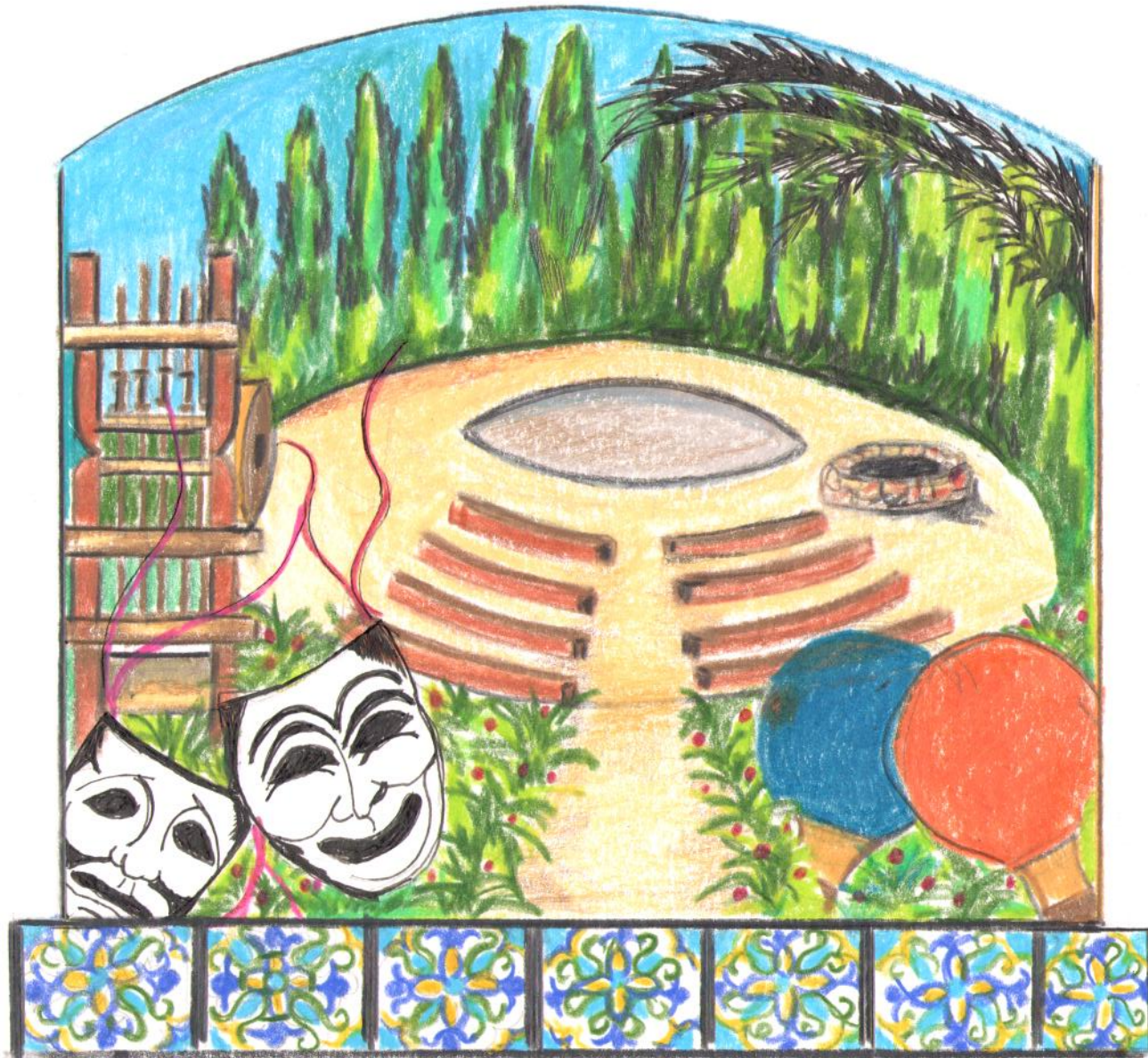
Panel 3 - Illustrates some of the park's current amenities, including the Hendy Stamp Mill, outdoor amphitheater and table tennis program.