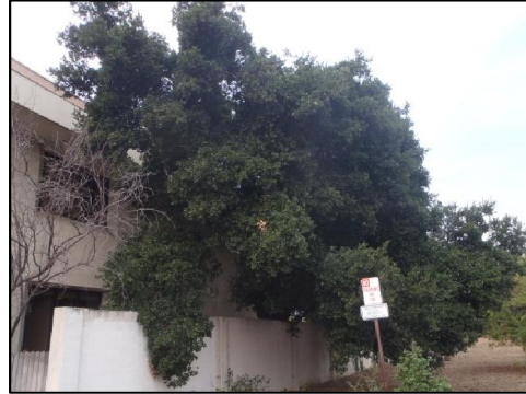
Photo 1. The canopy of coast live oak #118 extended over the property line and into the project area.

Coast live oak (20 trees) was the most frequently occurring species. Tree maturity ranged from young to mature. Tree trunk diameters were between 6" and 36". About half of the coast live oaks were smaller than 18" in diameter. Several large trees were present. Coast live oak #116 was 36" and in good condition. Tree #118 was also 36" but in fair condition. Both trees #116 and 118 were located off-site, near Wolfe Road, with canopies that extended over the wall separating the two properties (Photo 1).