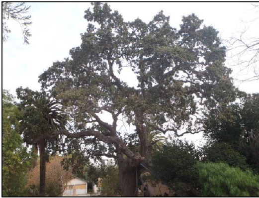
Photo 4. Valley oak #106. Above: tree crown. Right: lower trunk and scaffold limbs. Note failed branch (red arrow), areas of dead bark (yellow arrow) and large stub (blue arrow).