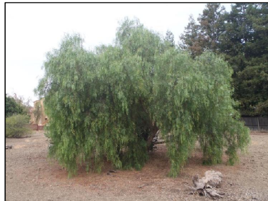
Photo 3. Typical Calif. pepper.

Nine (9) Calif. peppers were present (Photo 3). Several trees were located near the existing residence. Trees ranged from young (#151, 160) to semi-mature (#136, 140, 143) to mature (#128, 141, 169) to overmature (#115). Located near the entrance to the site, Calif. pepper #115 was 47" and in fair condition with several large stems. Tree condition varied by diameter with the small trees in excellent condition while larger trees were in fair and poor (#140, 141) condition.