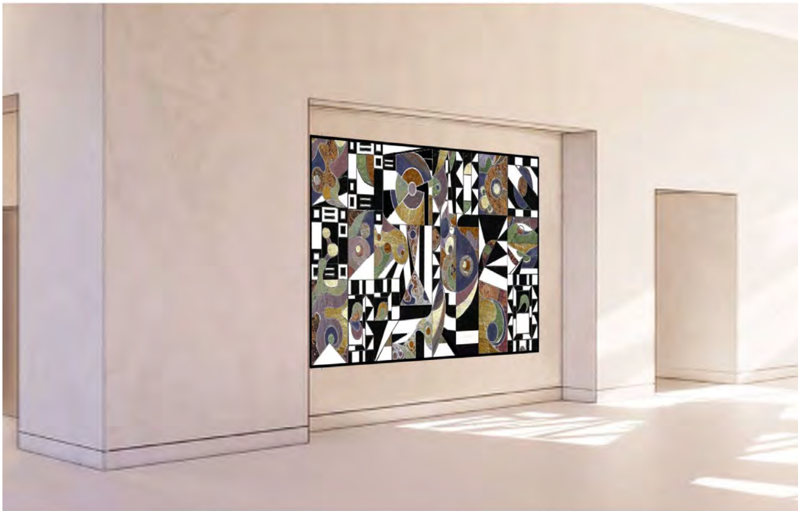
"The Unity of the Opposites" , Mixed-media Proposal for the Sunnyvale City Hall Art Wall

Dominic Panziera www.ARTECLETICA.com Daniela Garofalo