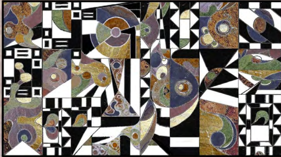
“The Unity of the Opposites” , Mixed-media Proposal for the Sunnyvale City Hall Art Wall