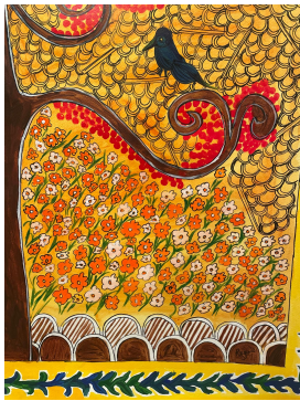
Close view of the motifs