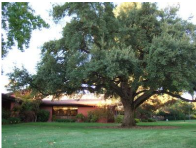
‘Sustainability’ Holly Oak Tree, Sunnyvale