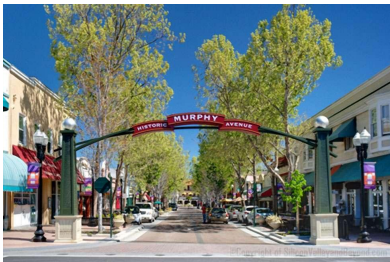
‘Bold’ Colors in the motifs from Murphy Ave