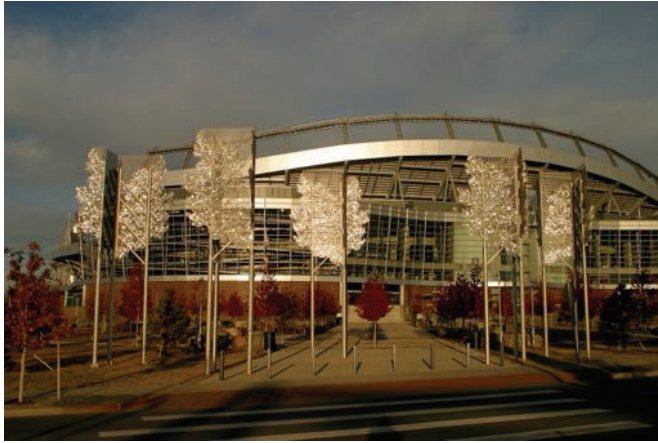
Pass Through the Land: Aspen Towers Sports Authority Field at Mile High, Denver, CO