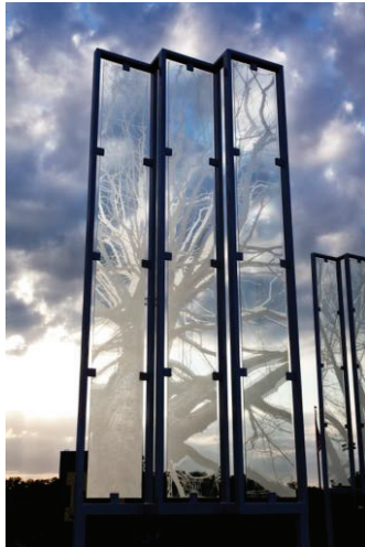
Arbor Winds (detail) East Stadium Bridge, Ann Arbor, MI