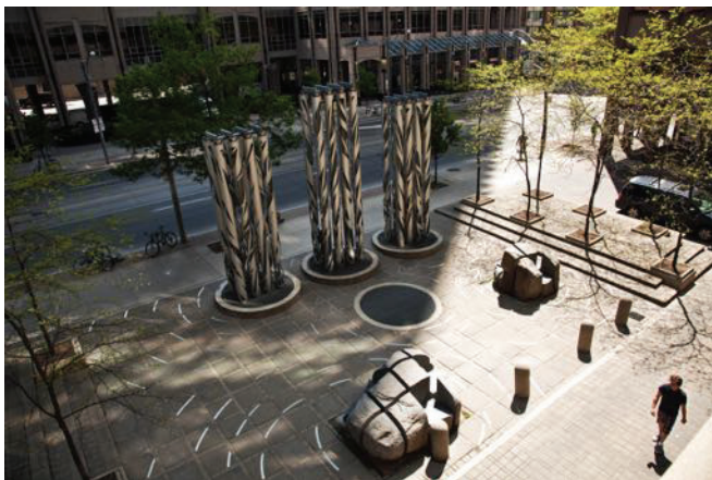
Liquid Echo 750 Bay Street, Toronto, Canada