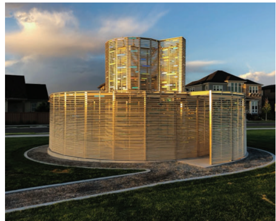
Woven Light Northfield Uplands Park, Stapleton, CO