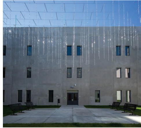
Passing Storms: Rain, Cloud (detail) Oregon State Hospital, Junction City, OR