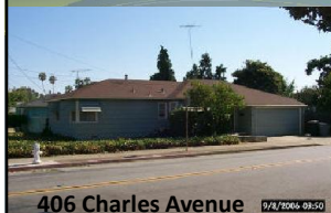
406 Charles Avenue 9/8/2006 08:50