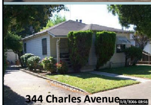
344 Charles Avenue 9/8/2006 08:54