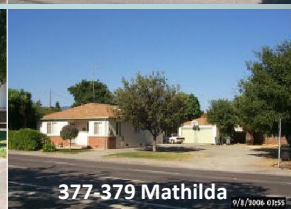
377-379 Mathilda 9/8/2006 08:55