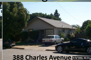
388 Charles Avenue 9/8/2006 08:57