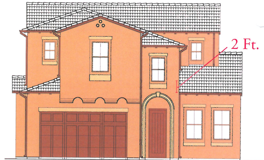
Plan 1A - New Design