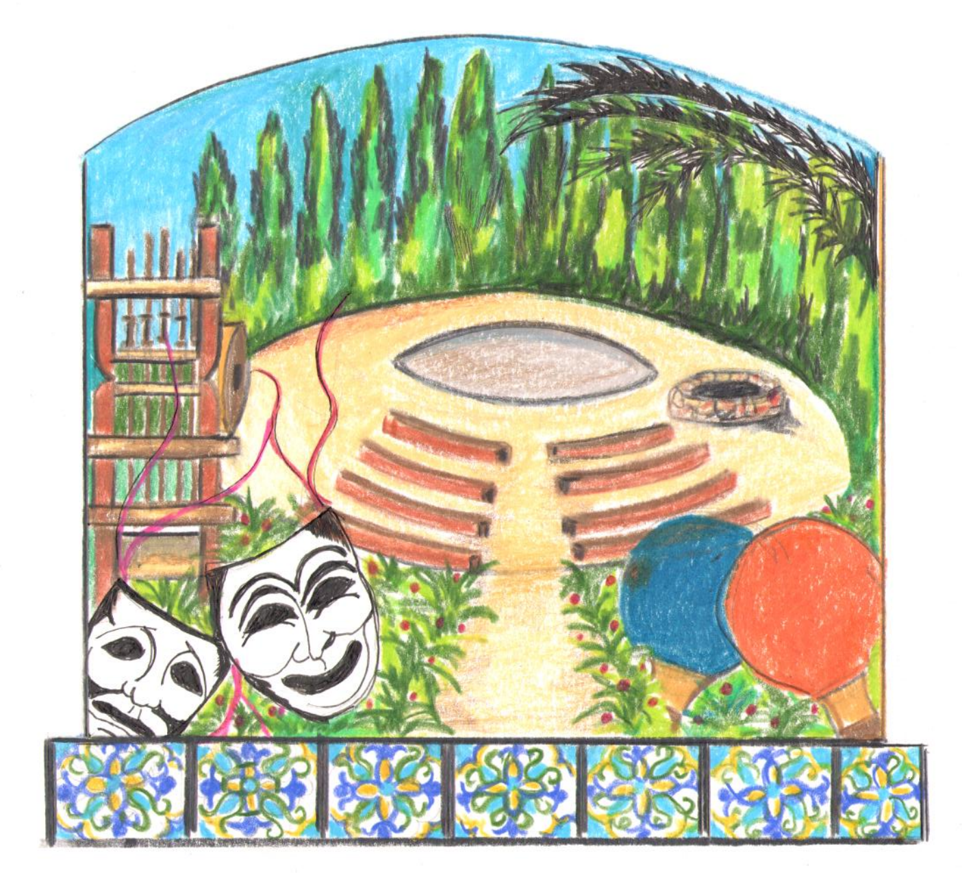
Panel 3 - Illustrates some of the park's current amenities, including the Hendy Stamp Mill, outdoor amphitheater and table tennis program.