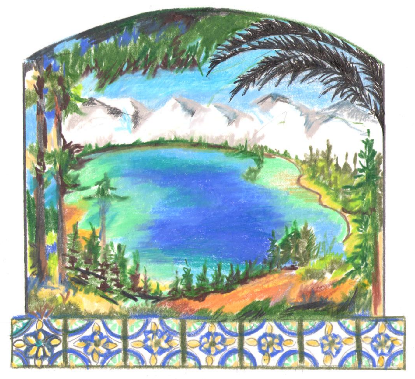
Panel 1 - Illustrates the historical account of the Murphy family's journey to California in 1884. The family was among the first settlers to cross the Sierra mountain range.