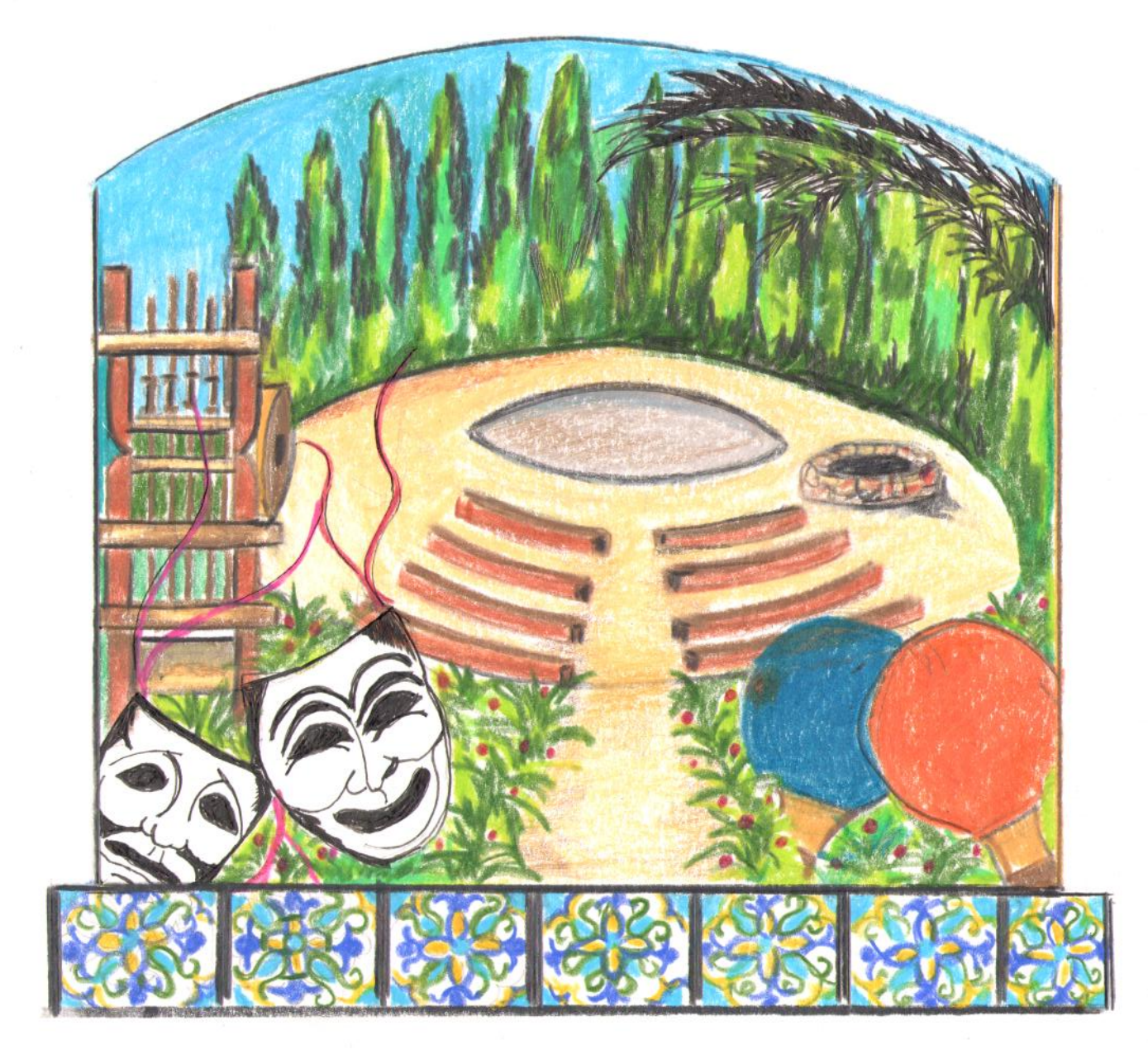
Panel 3 - Illustrates some of the park's current amenities, including the Hendy Stamp Mill, outdoor amphitheater and table tennis program.