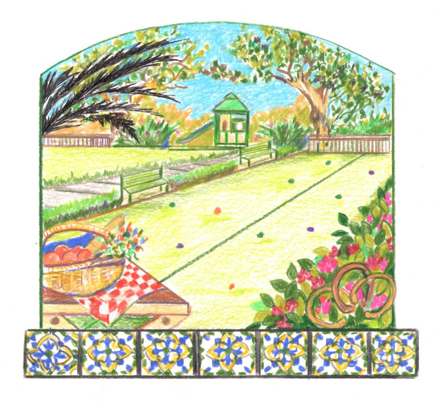
Panel 4 - Illustrates additional park amenities, including picnic facilities, horseshoe pits, park benches, play structure and lawn bowling green.