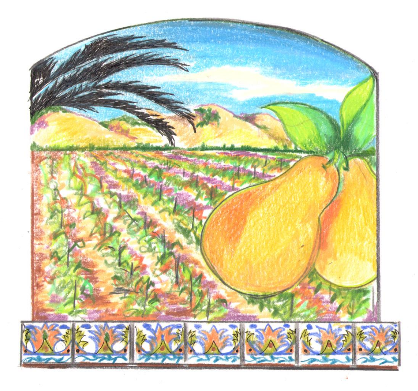
Panel 2 - Illustrates the development of California's vineyards and Sunnyvale's agricultural history.