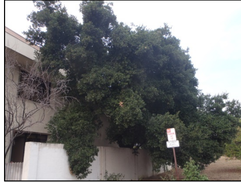
Photo 1. The canopy of coast live oak #118 extended over the property line and into the project area.

Coast live oak (20 trees) was the most frequently occurring species. Tree maturity ranged from young to mature. Tree trunk diameters were between 6" and 36". About half of the coast live oaks were smaller than 18" in diameter. Several large trees were present. Coast live oak #116 was 36" and in good condition. Tree #118 was also 36" but in fair condition. Both trees #116 and 118 were located off-site, near Wolfe Road, with canopies that extended over the wall separating the two properties (Photo 1).