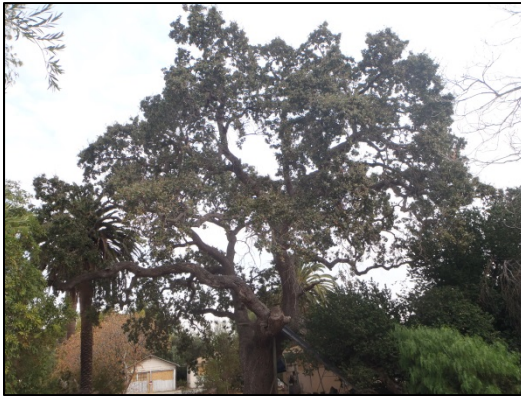
Photo 4. Valley oak #106. Above: tree crown. Right: lower trunk and scaffold limbs. Note failed branch (red arrow), areas of dead bark (yellow arrow) and large stub (blue arrow).