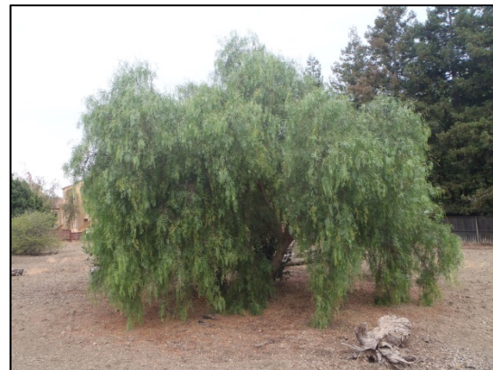
Photo 3. Typical Calif. pepper.

Nine (9) Calif. peppers were present (Photo 3). Several trees were located near the existing residence. Trees ranged from young (#151, 160) to semi-mature (#136, 140, 143) to mature (#128, 141, 169) to overmature (#115). Located near the entrance to the site, Calif. pepper #115 was 47" and in fair condition with several large stems. Tree condition varied by diameter with the small trees in excellent condition while larger trees were in fair and poor (#140, 141) condition.