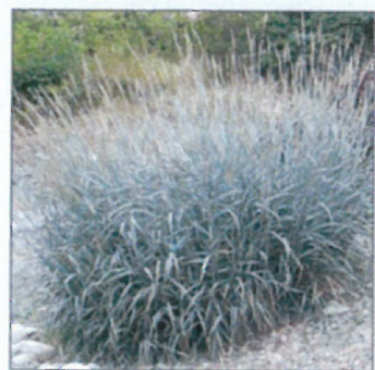
Blue Wildrye ( Elymus glaucus )