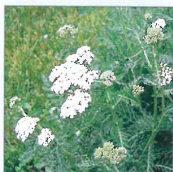
Common Yarrow ( Achillea millefolium )