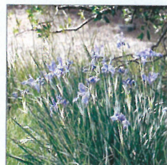
Bi-color Blue Iris ( Iris douglasiana PCH 'Bi-color Blue')