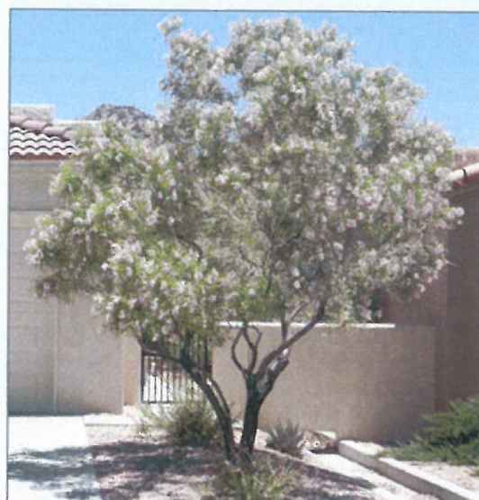
Desert Willow ( Chilopsis linearis 'Arts Seedles')