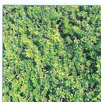
Emerald Carpet Manzanita ( Arctostaphylos uva-ursi 'Emerald Carpet')