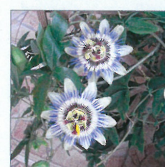
Blue Crown Passion Flower ( Passiflora caerulea )