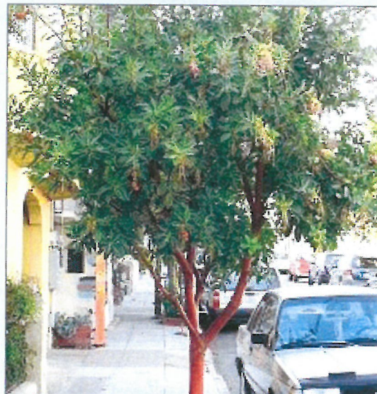
Strawberry Tree ( Arbutus unedo )