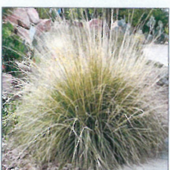
Deer Grass ( Muhlenbergia rigens )