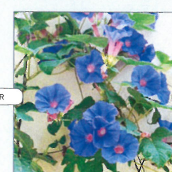
Blue Dawn Flower ( Ipomoea indica )