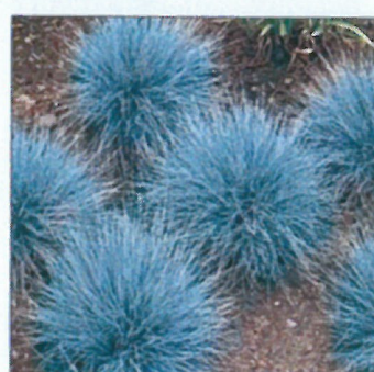
Blue Fountain California Fescue ( Festuca californica 'Blue Fountain')