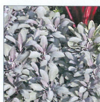
Purple Leaf Sage ( Salvia leucophylla 'Midnight')