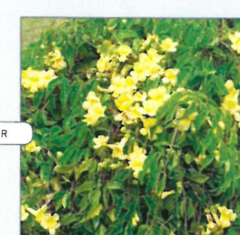
Yellow Trumpet Vine ( Macfadyena unguis-cati )