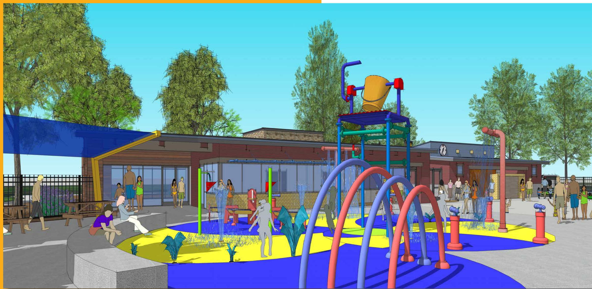
POOL DECK VIEW