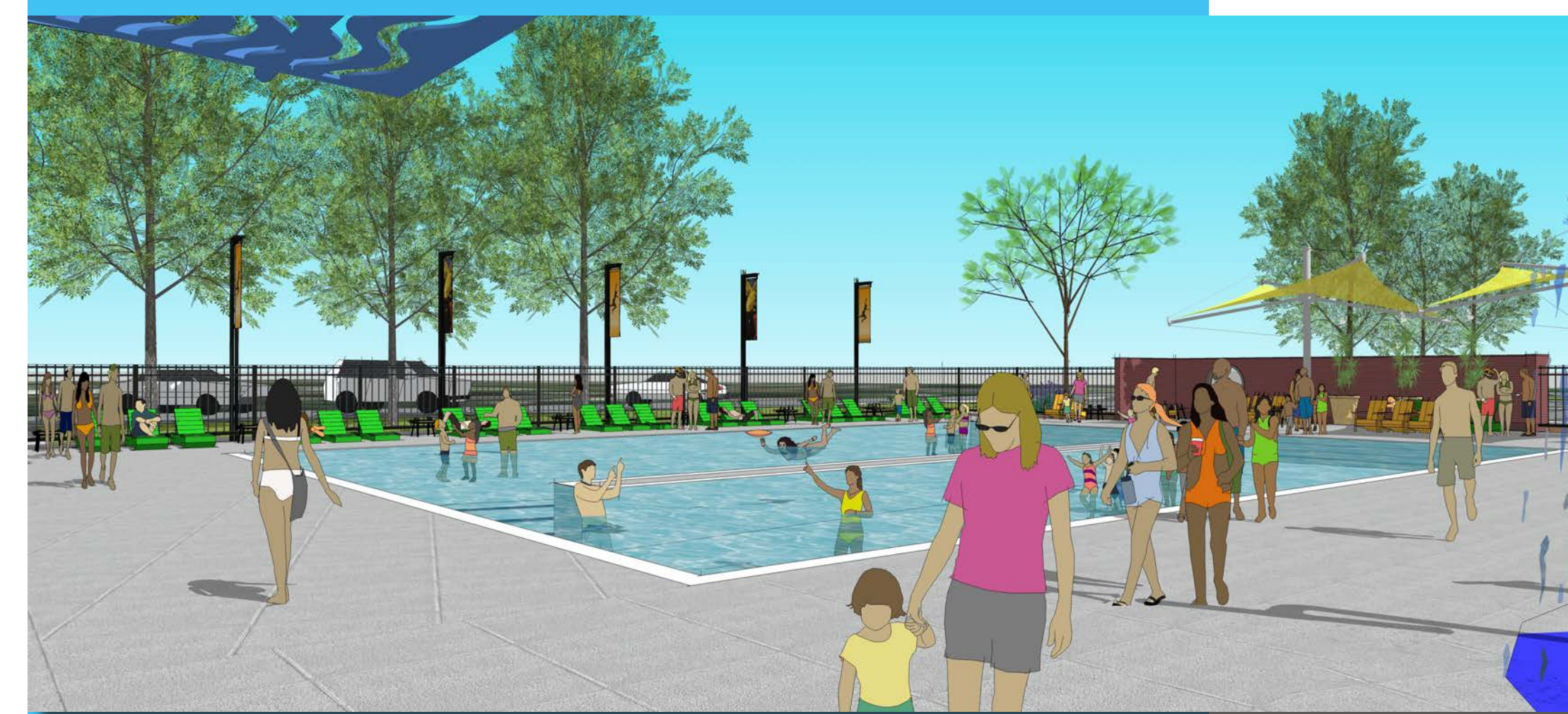
25 YD FULL COMBINATION POOL RECREATION AREA: 2'-6" TO 3'-6" DEEP LAP SWIM AREA: 4'-6" TO 6'-6" DEEP