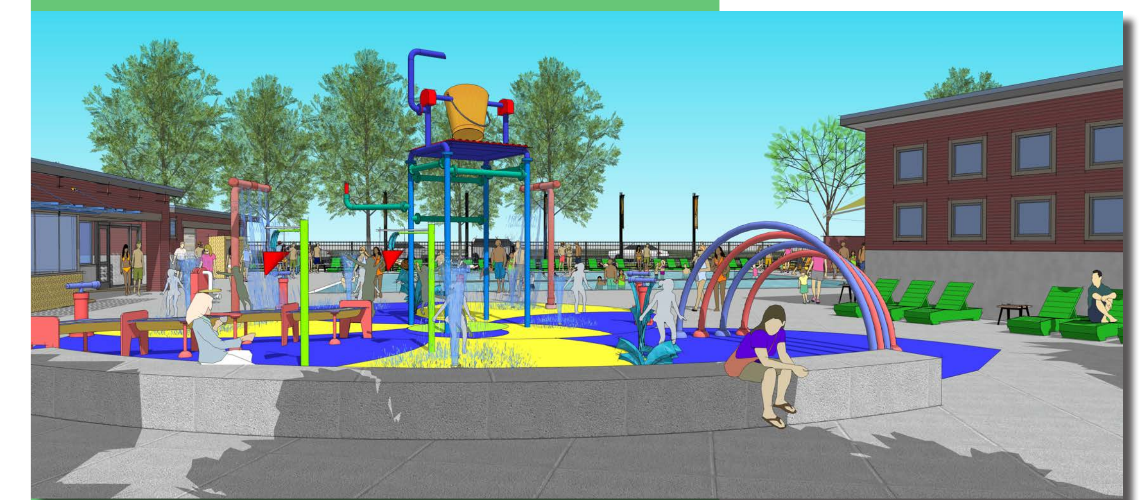
SPLASH PAD WITH YEAR ROUND PLAY STRUCTURE