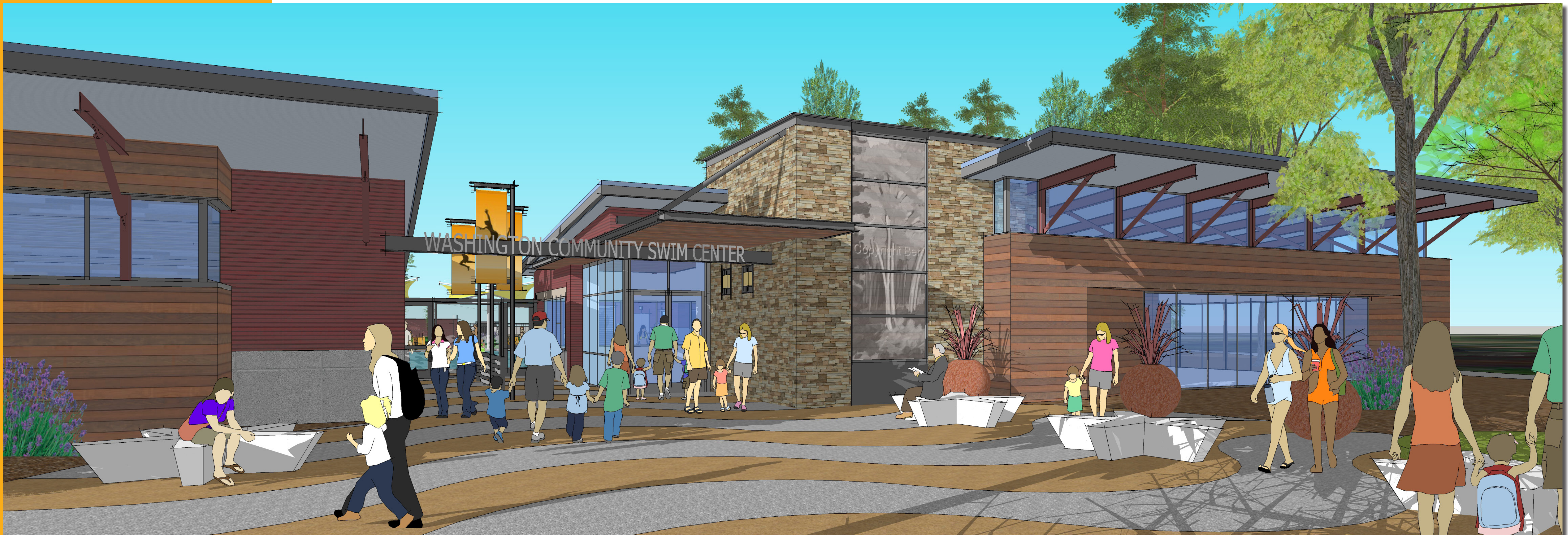
ENTRY VIEW CLOSE-UP