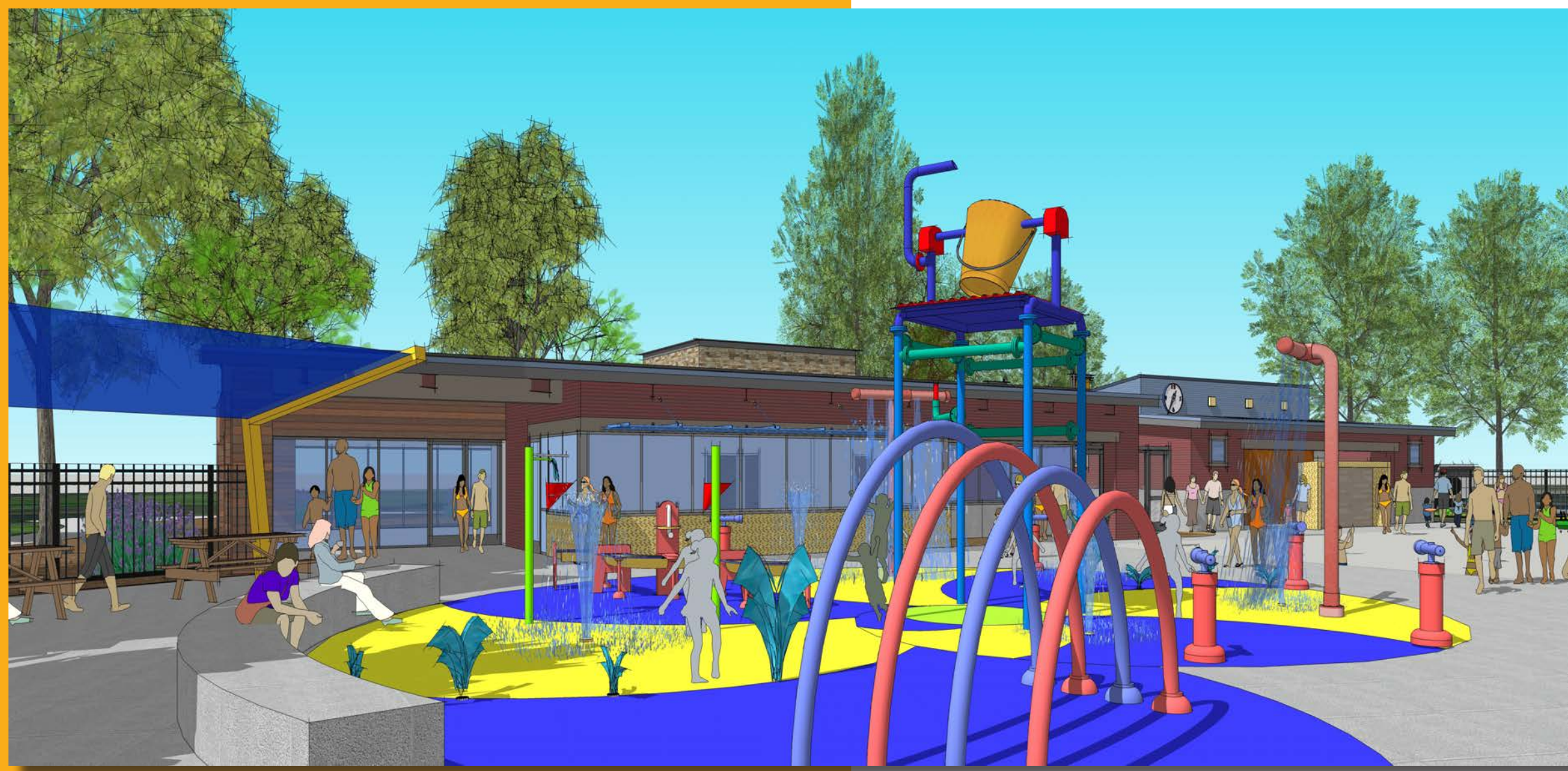
POOL DECK VIEW