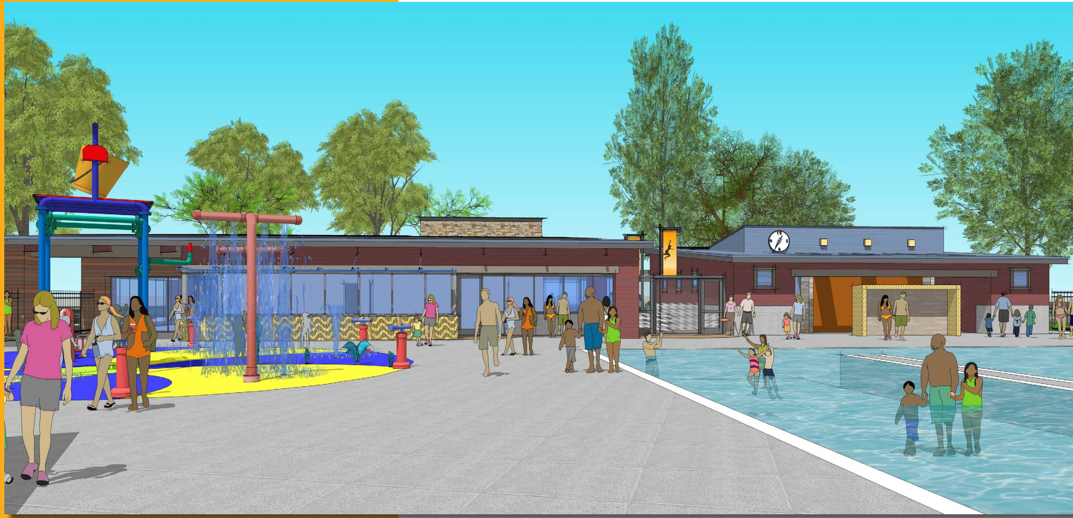
BACK VIEW FROM POOL