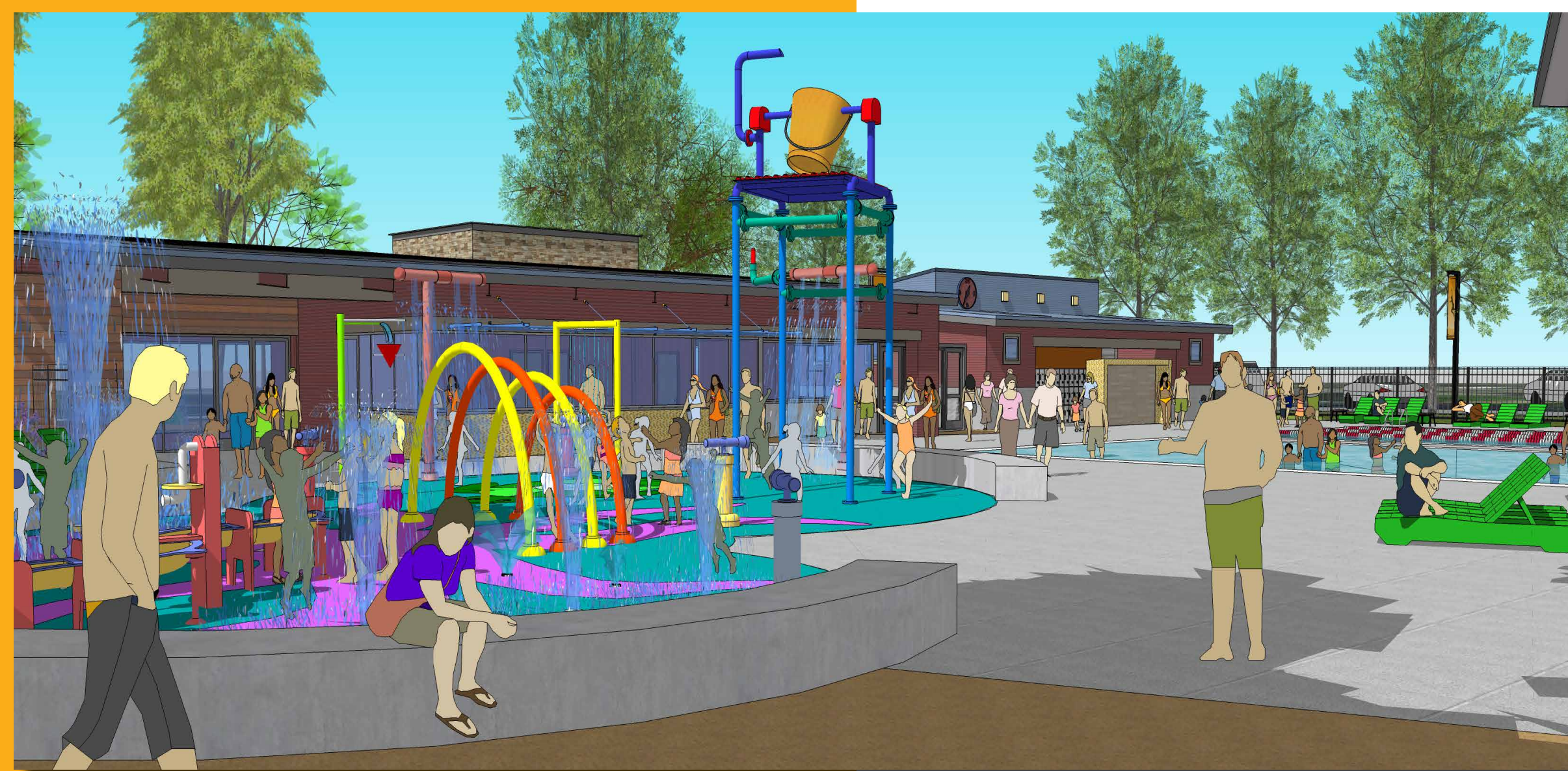
POOL DECK VIEW