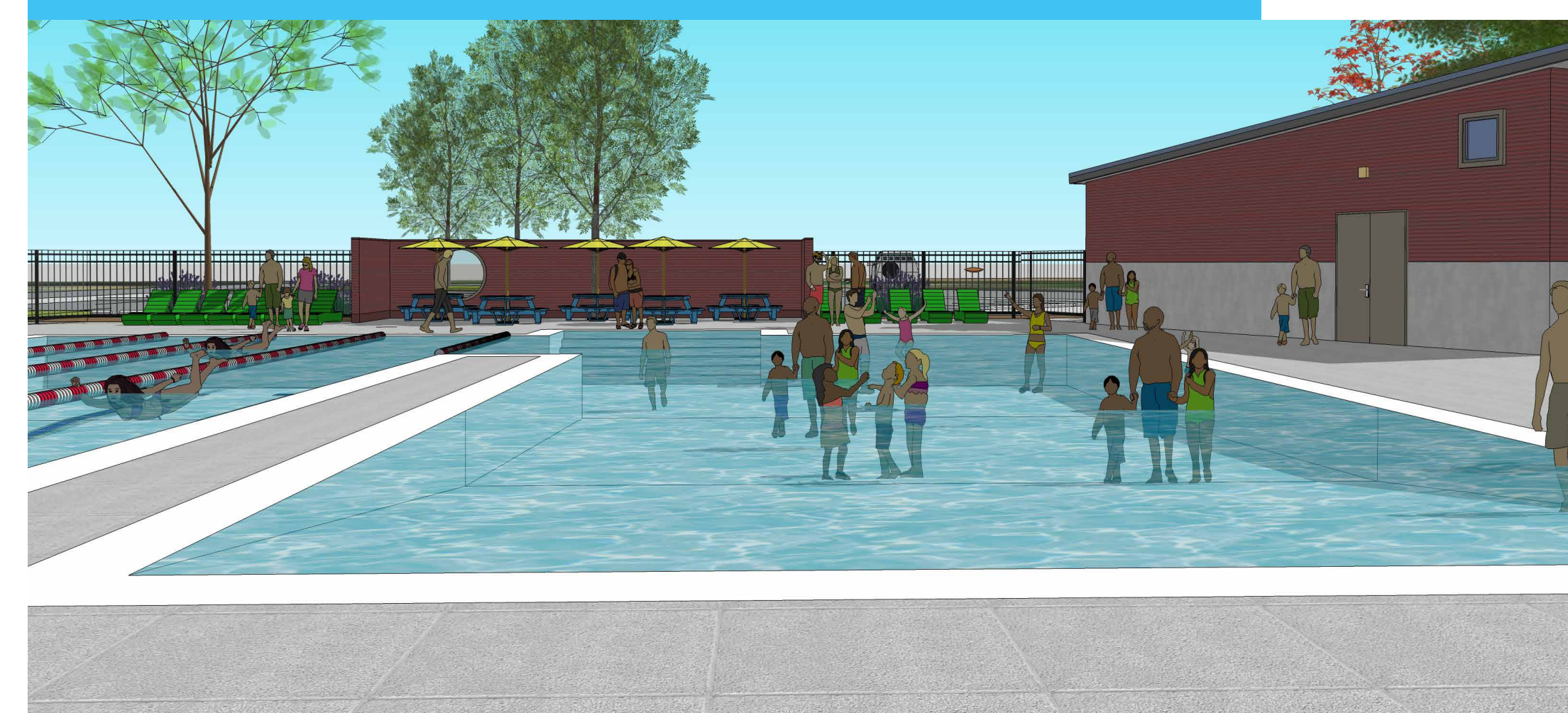
SPORT POOL - ZERO DEPTH ENTRY