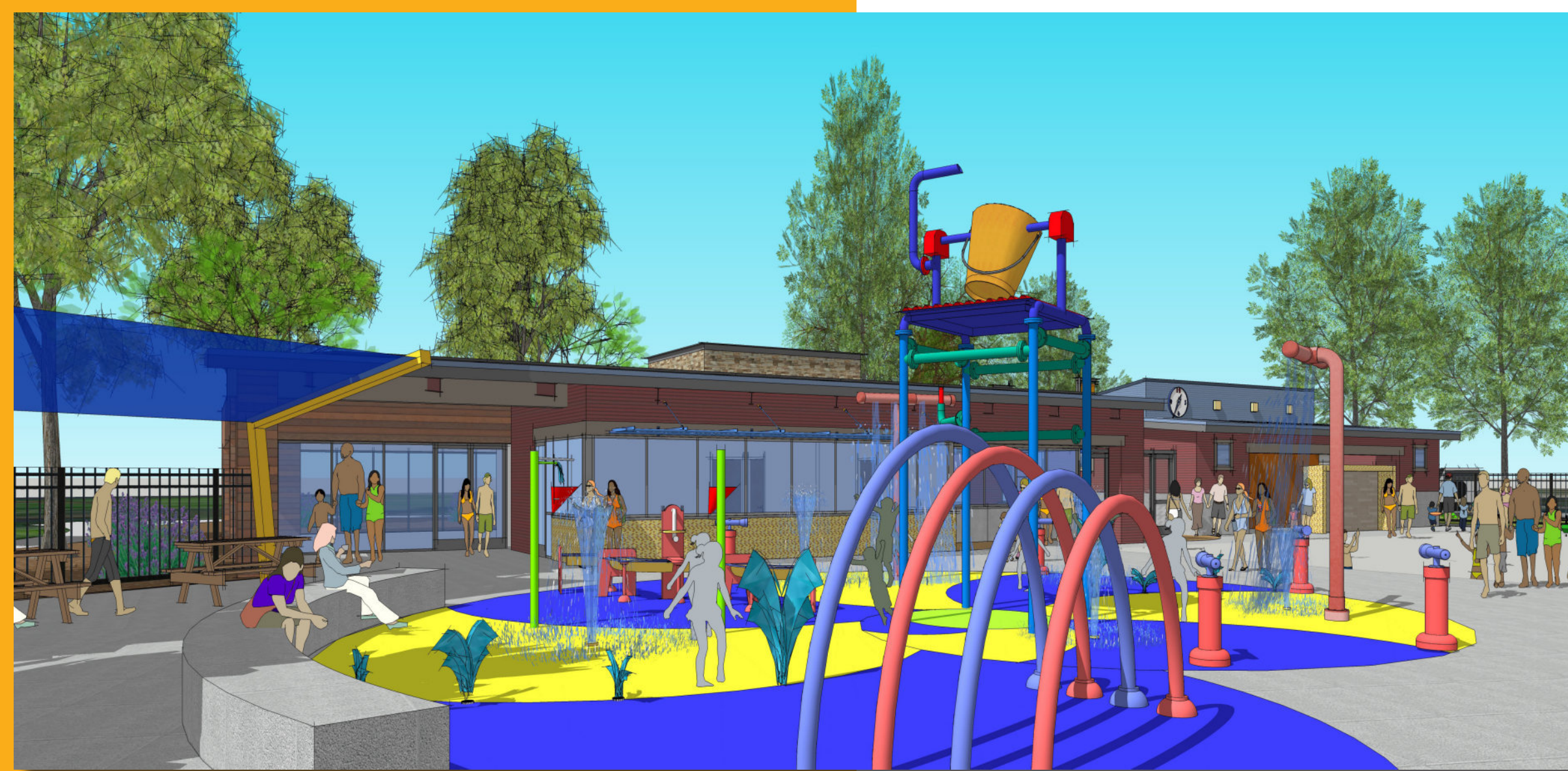
POOL DECK VIEW