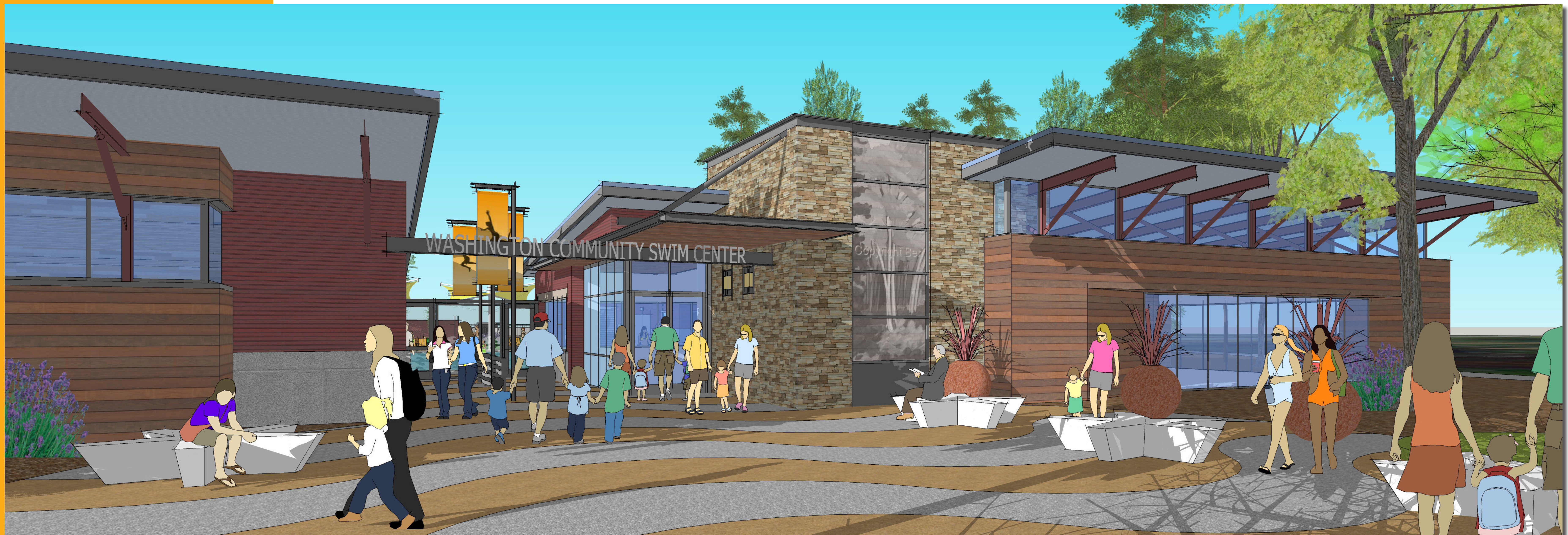
ENTRY VIEW CLOSE-UP