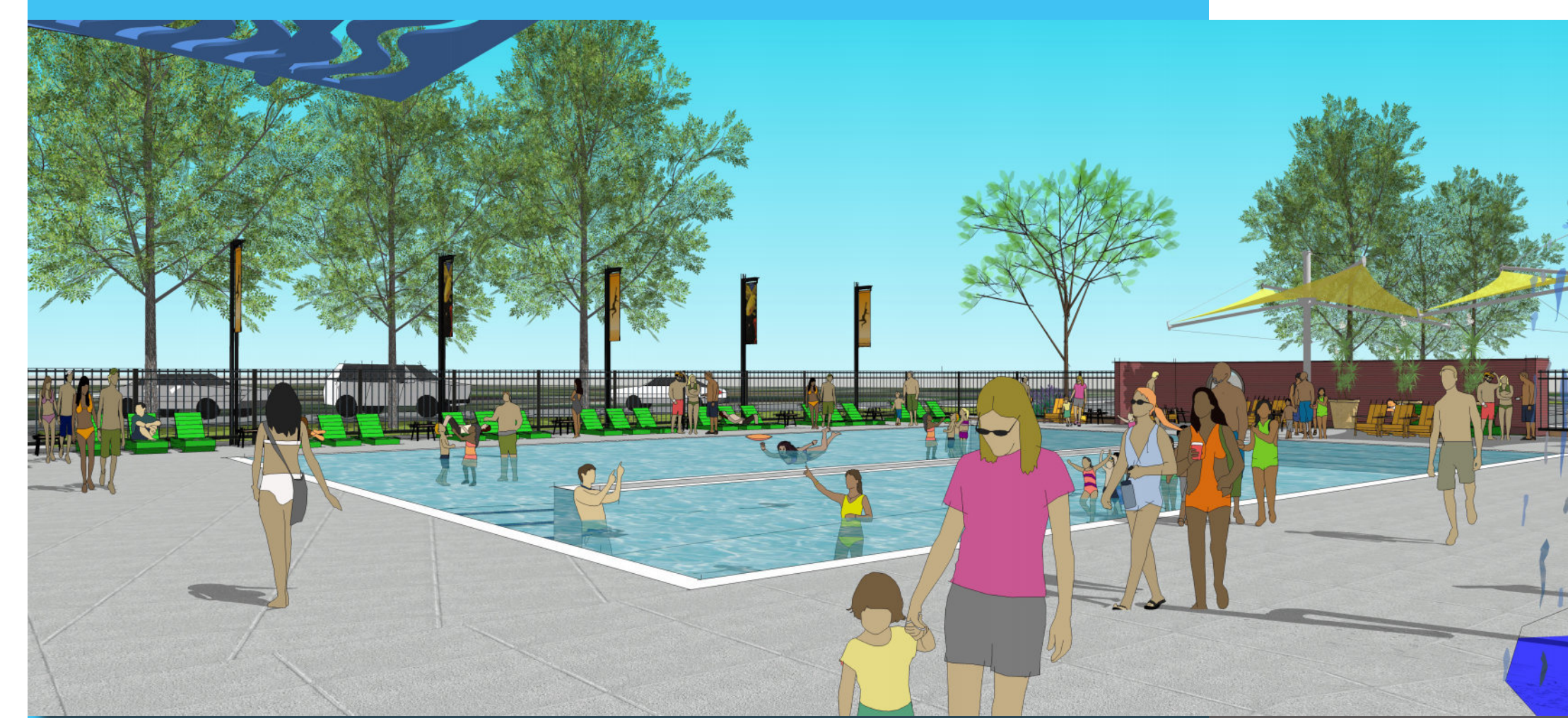
25 YD FULL COMBINATION POOL RECREATION AREA: 2'-6" TO 3'-6" DEEP LAP SWIM AREA: 4'-6" TO 6'-6" DEEP