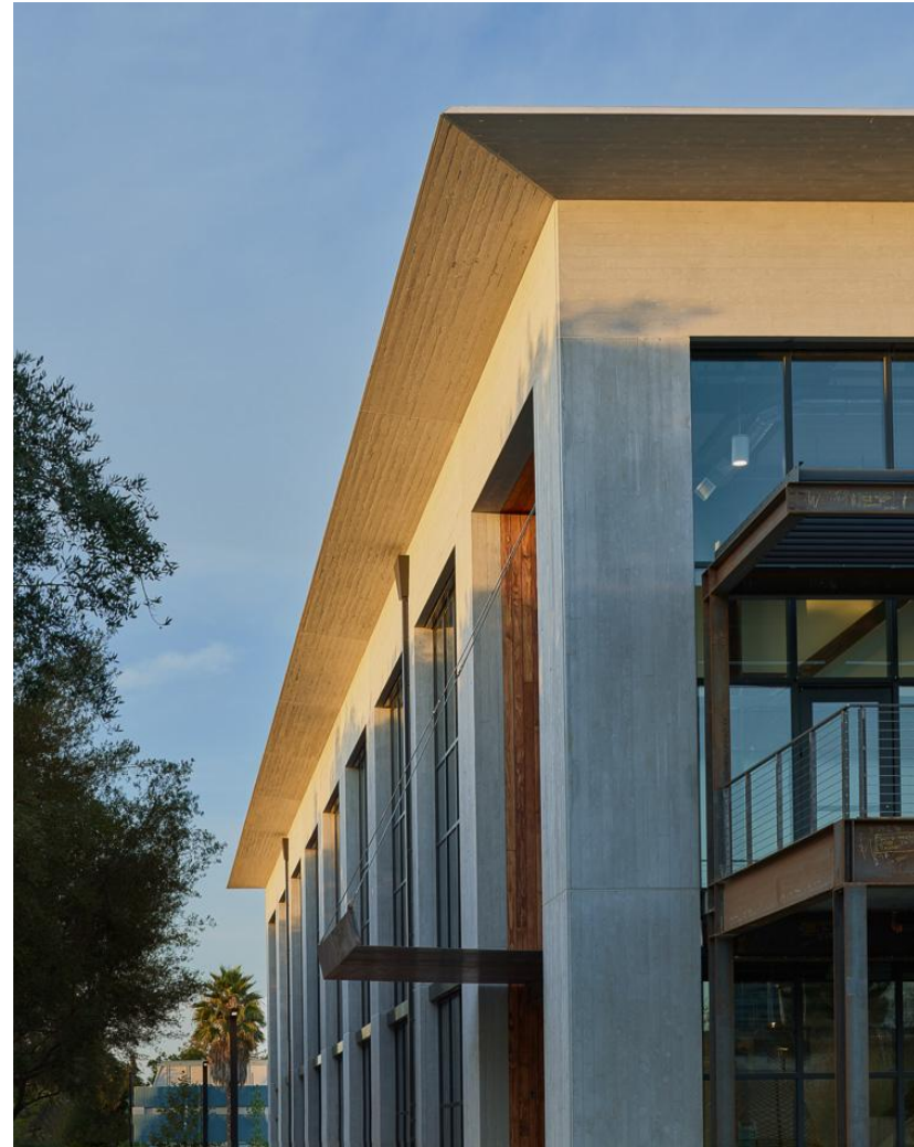
1212 Bordeaux (Owned - Development)