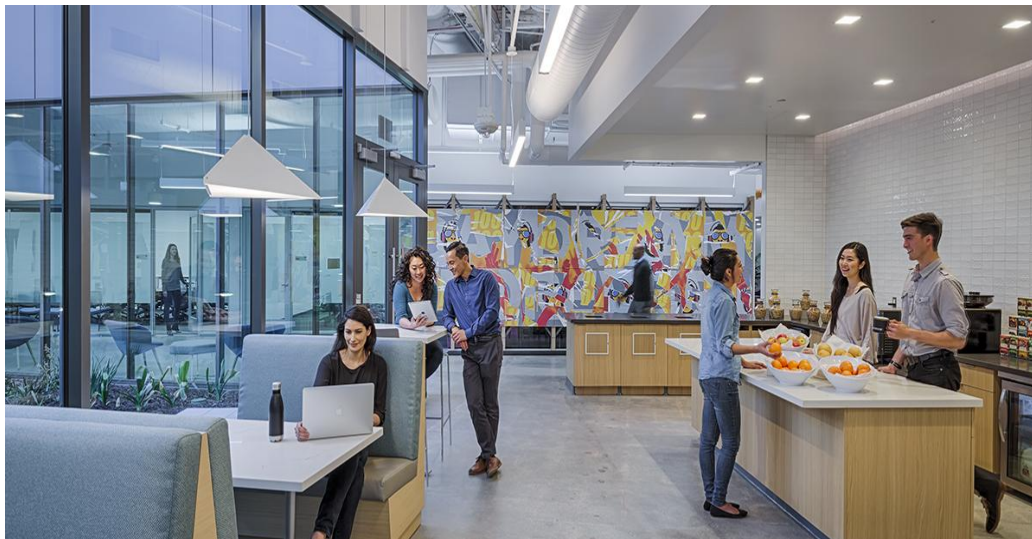
222 Caspian (Owned - Renovation)