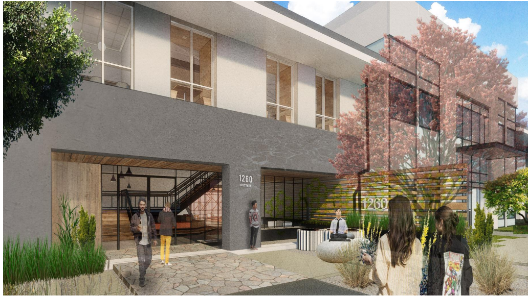
1240 & 1260 Crossman (Leased - Renovation)