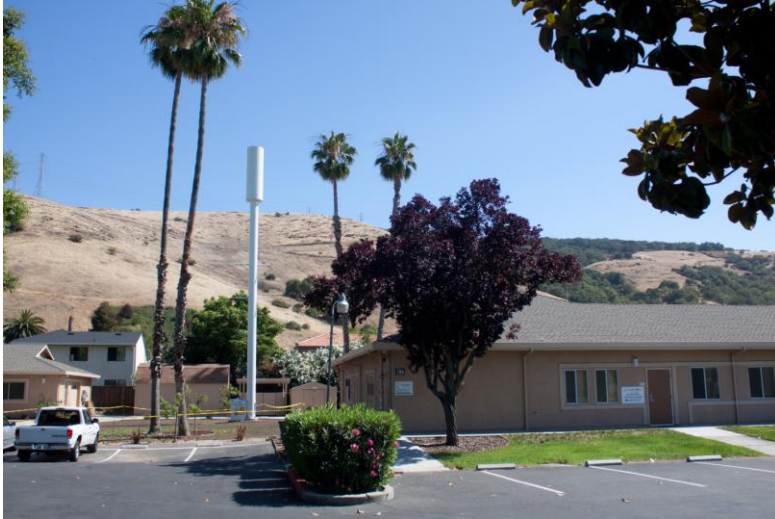
366 St. Julie Drive, San Jose