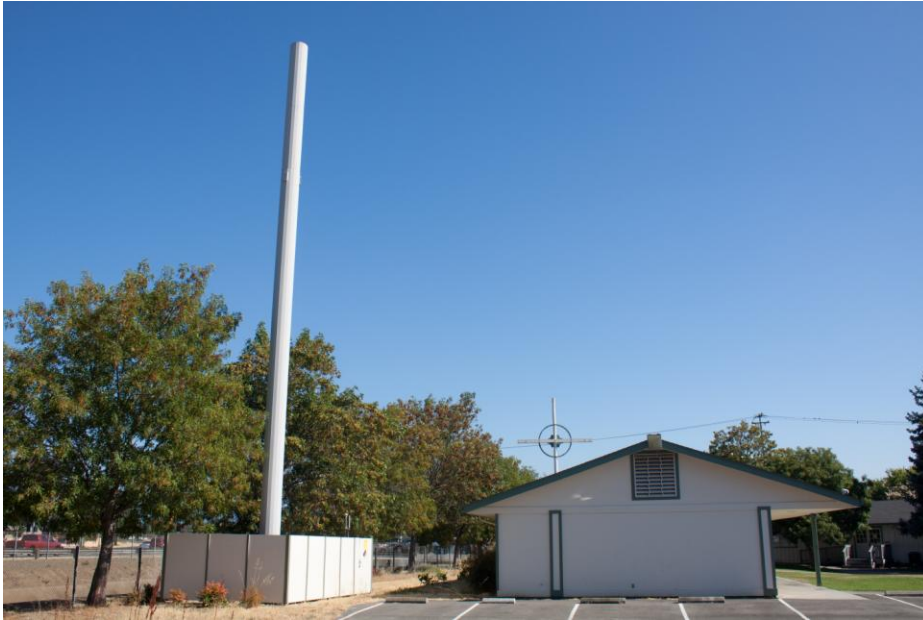
3675 Payne, San Jose