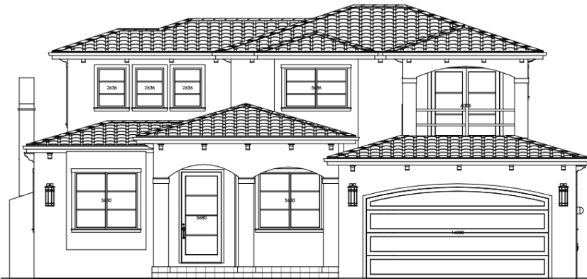
Proposed: 1159 Northumberland Dr.