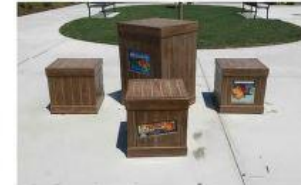
6 CRATES WITH WOOD FINISH