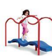
5 BALANCE BEAM