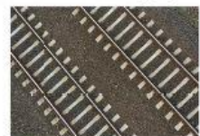
DESIGN INTENT: 'TRAIN TRACK PATTERNS'