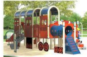
1 CENTER PIECE: KID EXPRESS TRAIN