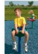
7 SADDLE SPINNER