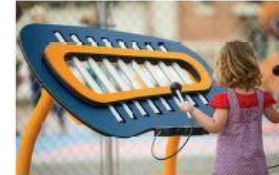
12 MUSICAL INSTRUMENTS ZONE