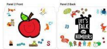
14 SELECTED CUSTOM FENCE PANELS (EDUCATIONAL THEME)