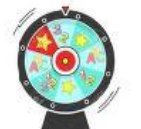
8 SPINNING DIAL ON BUILDING WALL