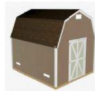
2 STORAGE SHED (10' x 8')