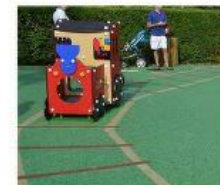
3 SURFACING: POURED IN PLACE RUBBER W/ CUSTOM PATTERN