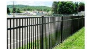
15 4' HIGH ORNAMENTAL IRON FENCE