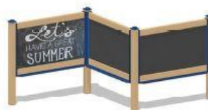
11 OUTDOOR MAGNETIC CHALKBOARD