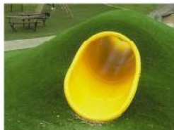
4 ARTIFICIAL TURF MOUND W/ TUNNELS