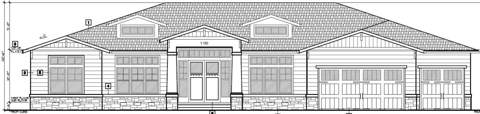
Proposed (Draft Revision)