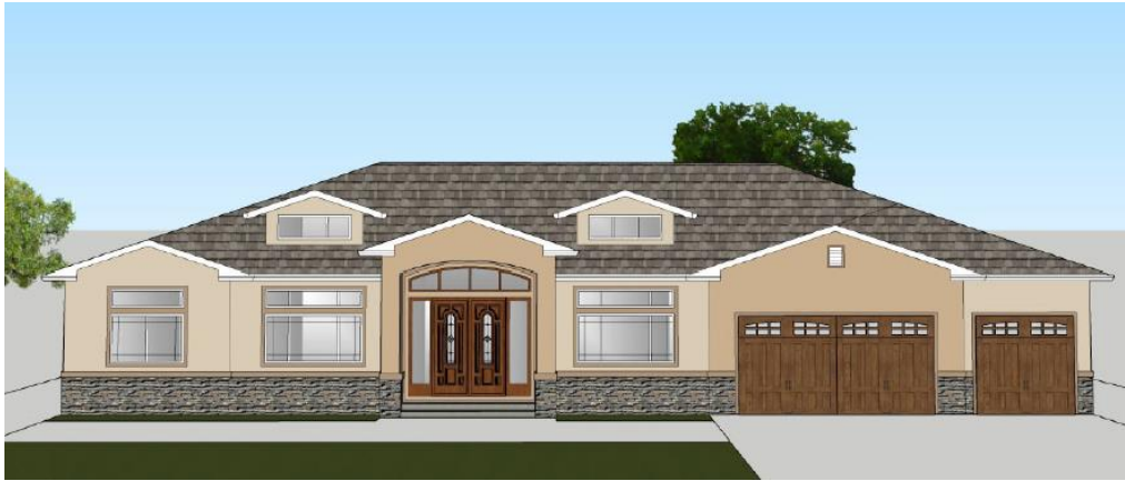
Proposed (As reviewed in April, 2019)