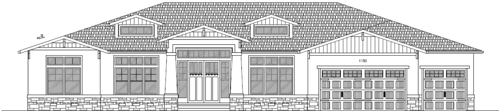
Proposed (Final Revision)