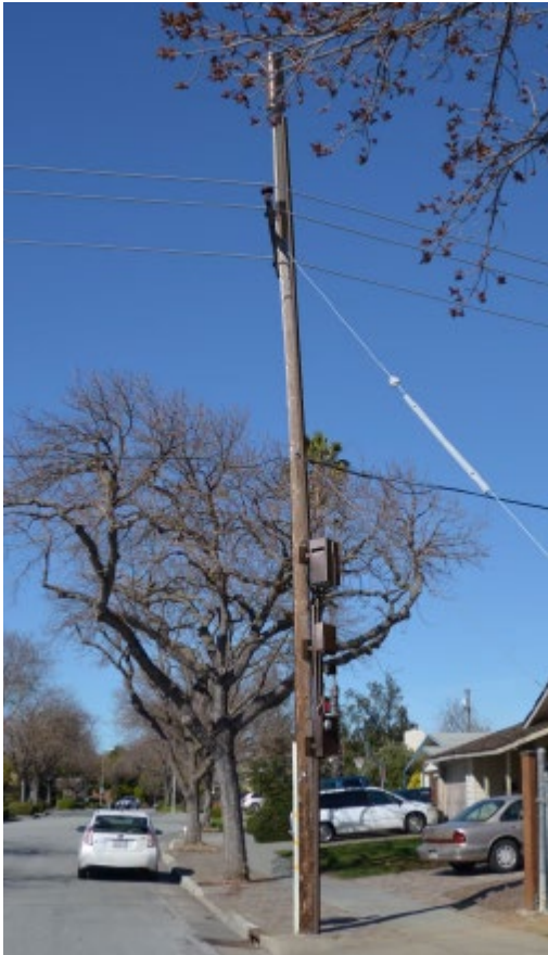
Pole Mounted - 1