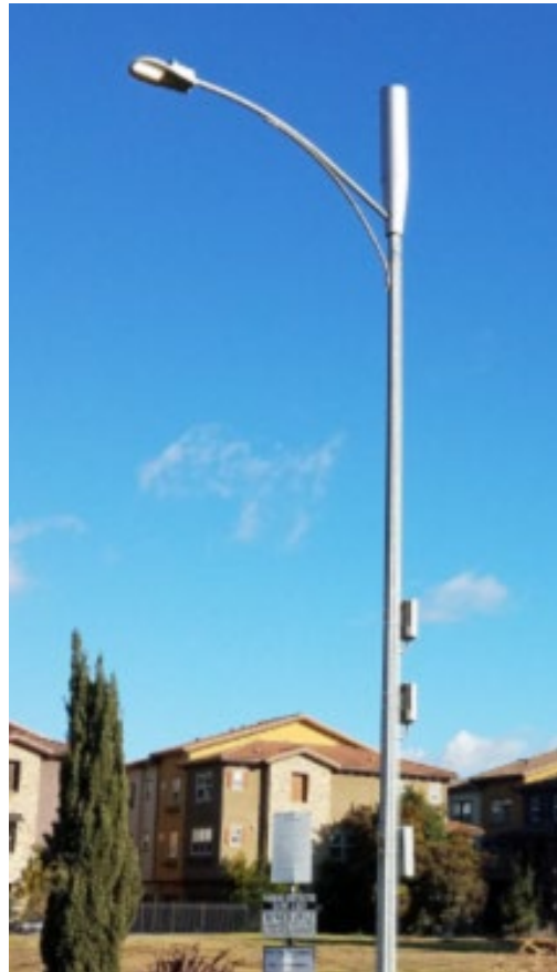
Pole Mounted - 2