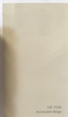
2. WINDOW TRIM/CORNICE SHERWIN WILLIAMS SW7036 ACCESSIBLE BEIGE