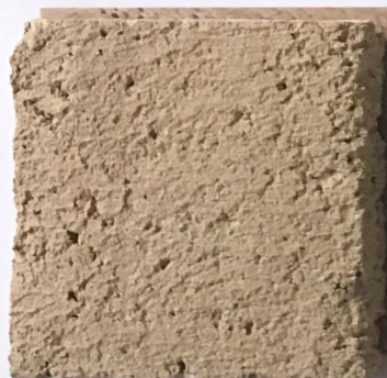
1. PERIMETER SITE WALL ANGELUS BLOCK SLUMPSTONE - DOESKIN