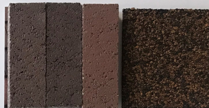
6. CONCRETE TILE ROOF EAGLE ROOFING BEL AIR - 4606 VALLEJO RANGE