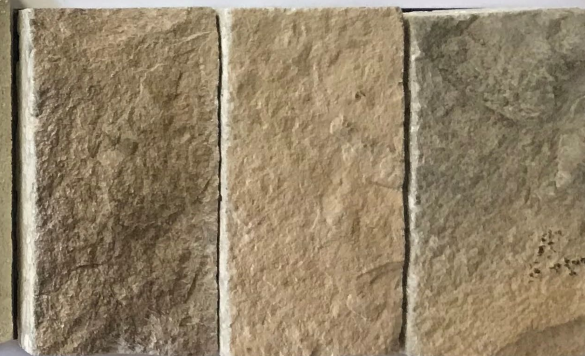
ELDORADO STONE LIMESTONE - SAN MARINO