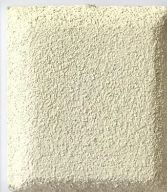
4. EXTERIOR STUCCO FINISH OMEGA 30/30 SAND COLORTEK 12 CHENILLE